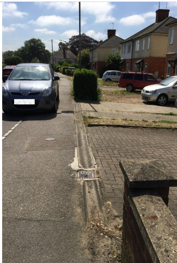
Figure 3-2: Concrete drainage channel along back of pavement