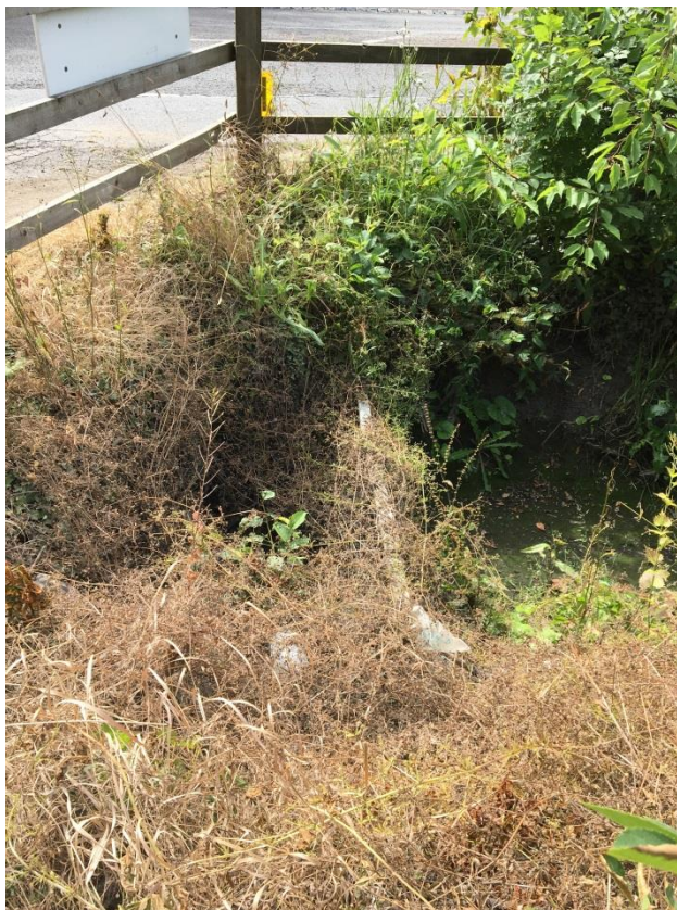
Figure 1-2: Private ditch alongside Wolverton Road, west of M1

Newport Pagnell acts as a confluence for multiple watercourses, including the River Great Ouse, Tongwell Brook, Chicheley Brook and the River Ouzel, as shown on Figure 1-1. These are a combination of open channels, such as one alongside Wolverton Road to the west of the M1 (see Figure 1-2), and also culverted watercourses.