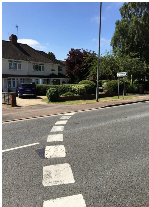
Figure 3-4: Dropped kerb adjacent to roundabout