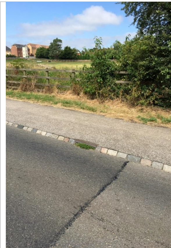
Figure 3-1: Heavily vegetated gully