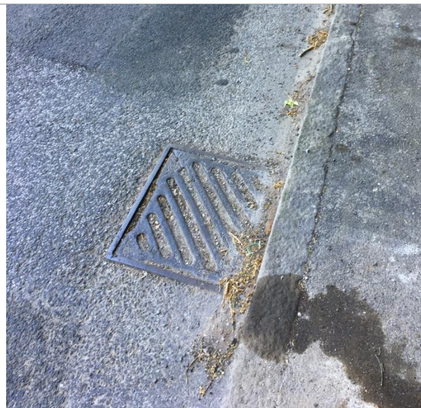
Figure 3-5: Blocked road gully on Wolverton Road