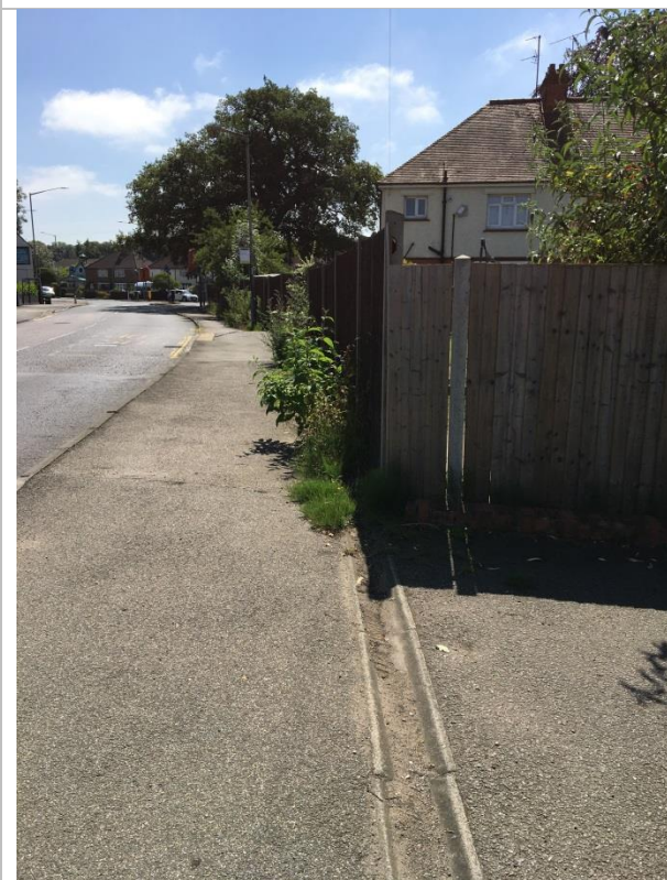
Figure 3-3: Vegetation in concrete channel