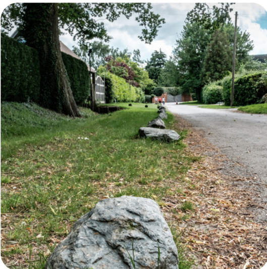
Rocks placed on a verge by a local resident to prevent parking

We have installed verge protection in some areas to prevent vehicles being parked on there. This includes measures like ascot fencing or grasscrete. However we cannot install these measures at every site due to the installation and maintenance costs. Parish-funded schemes for verge protection can usually be done following a suitability assessment by a highways officer to look at the area and any existing issues. The work will have to be approved and managed by the Highways team.