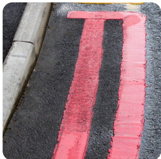
Double red lines