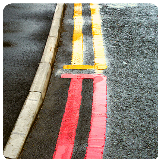
Red and yellow lines painted on road