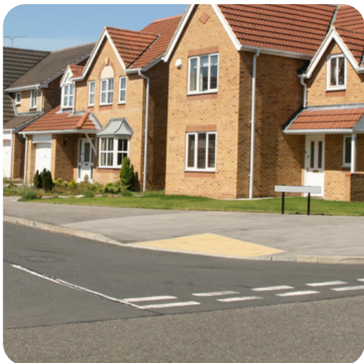
Dropped kerb for pedestrians with tactile paving

More details about this fund and the schemes funded by it are on our Highways section at www.milton-keynes.gov.uk/highways