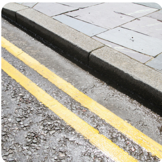
Double yellow lines

Usually on the roads outside hospitals or HM Government buildings a sports stadium, these lines mean 'No stopping/parking or loading/unloading at any time'. You may only stop on these lines if you are having a medical emergency or your vehicle has broken down. You should not put hazard lights on to show you are parking.