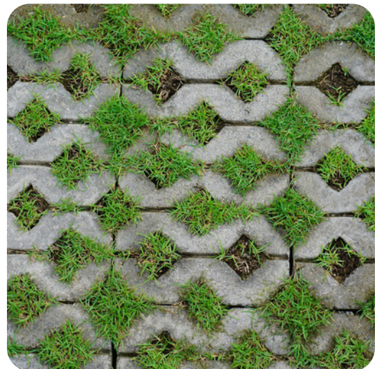
Grasscrete is an option to protect a grass verge from vehicles