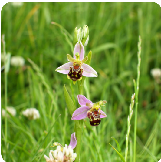
The bee orchid growing in a verge

Grass verges are a haven for wildflowers like the bee orchid (pictured) and insects so our Landscaping team schedule mowing around the expected growing patterns of the grass. The mowing is done on a cyclical program between March and late October. By changing the frequency and timing of cutting rural grass verges more flowers are able to grow which encourages more insects including pollinators like bees to thrive.