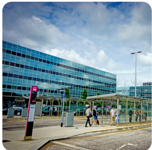
Granite kerbs at Station Square, CMK