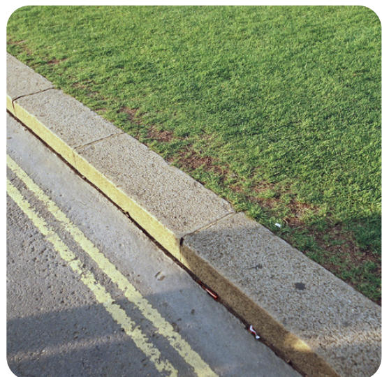
Granite kerb in CMK with double yellow lines