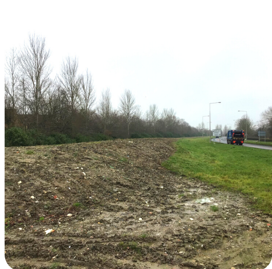
A bund protecting the verge from illegal encampments