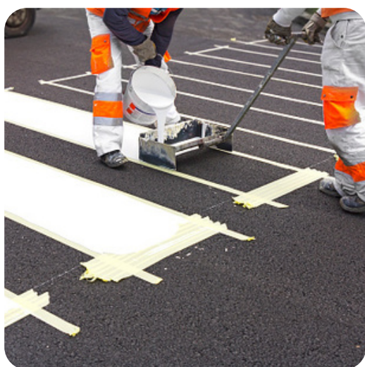
Applying white paint for a Zebra crossing

You can apply for APMs on our website but check the criteria thoroughly before you apply as we will only consider adding Access Protection Markings where the access is not obvious to drivers e.g. a concealed entrance. There must also be a proven problem of continuous obstruction. There is a charge for installing APMs which also includes the cost of the application process. Any future maintenance costs will be in addition to the original fee.