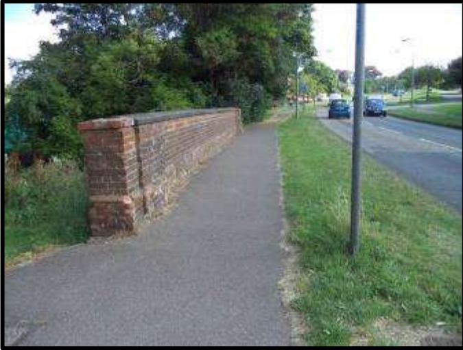
West parapet looking North