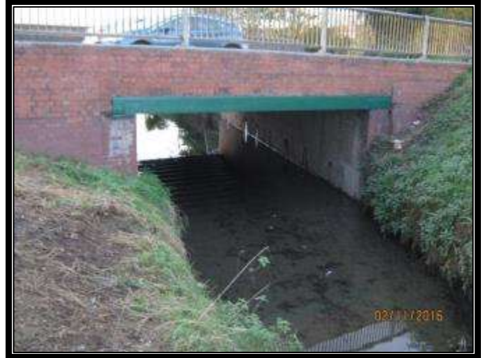
East Elevation of the bridge