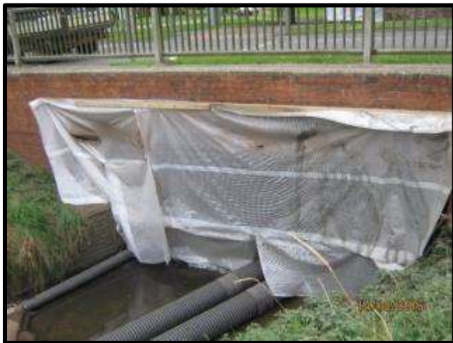
Temporary screening during the underside works.