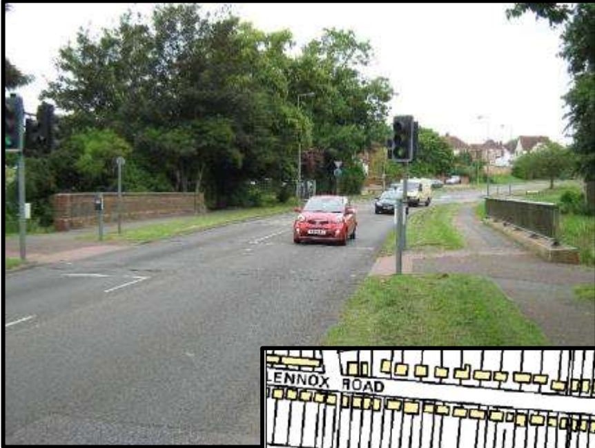
View southwards over the bridge

Ringway, the Highways Contractor working on behalf of Milton Keynes Council, will be carrying out major bridge refurbishment work on Water Eaton Bridge. The structure is located at Manor Road (C162) over a tributary of the River Ouzel known as Water Eaton Brook.