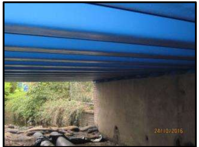
Completed paintwork to underside