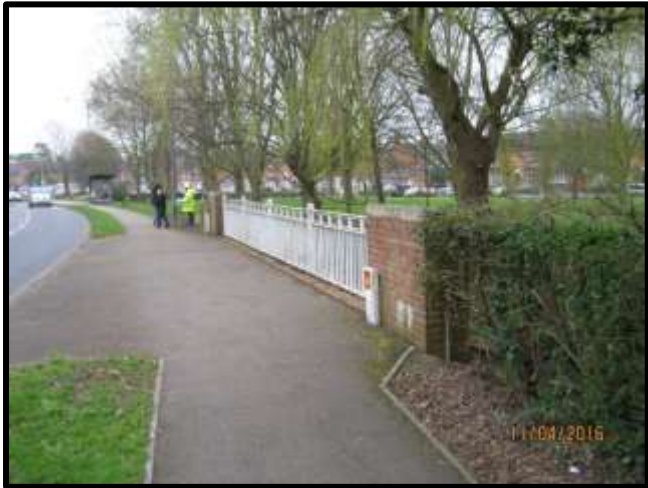
South verge looking East