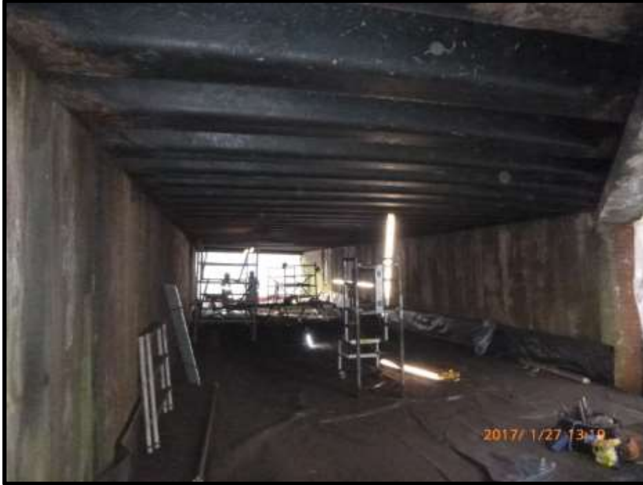
Surface preparation for shot blasting and painting