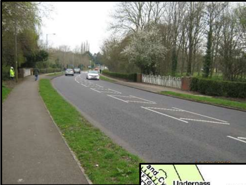
Looking west towards the bridge

Ringway, the Highways Contractor working on behalf of Milton Keynes Council, will be carrying out major bridge refurbishment work on New Bradwell Bridge. The structure is located at Newport Road (C140), over a tributary to the Great Ouse River.