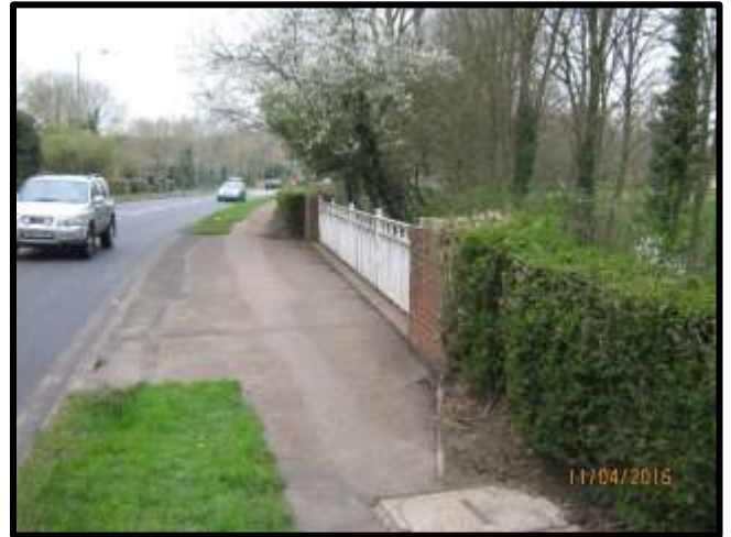
North verge looking West