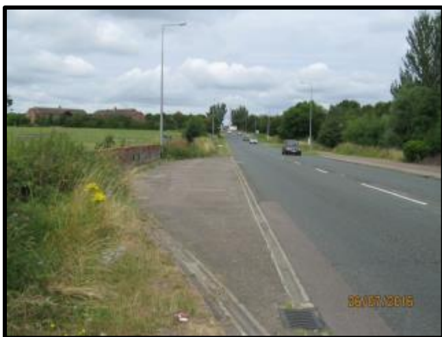
West verge and parking area looking North