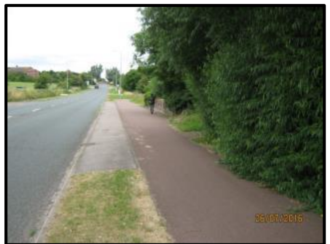
East verge and redway looking North