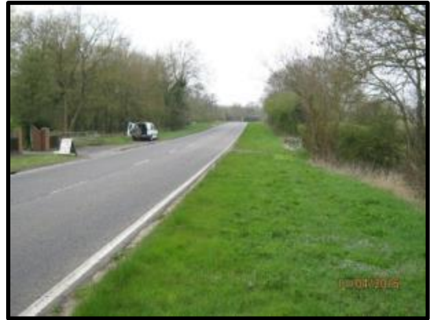
Looking West towards bridge