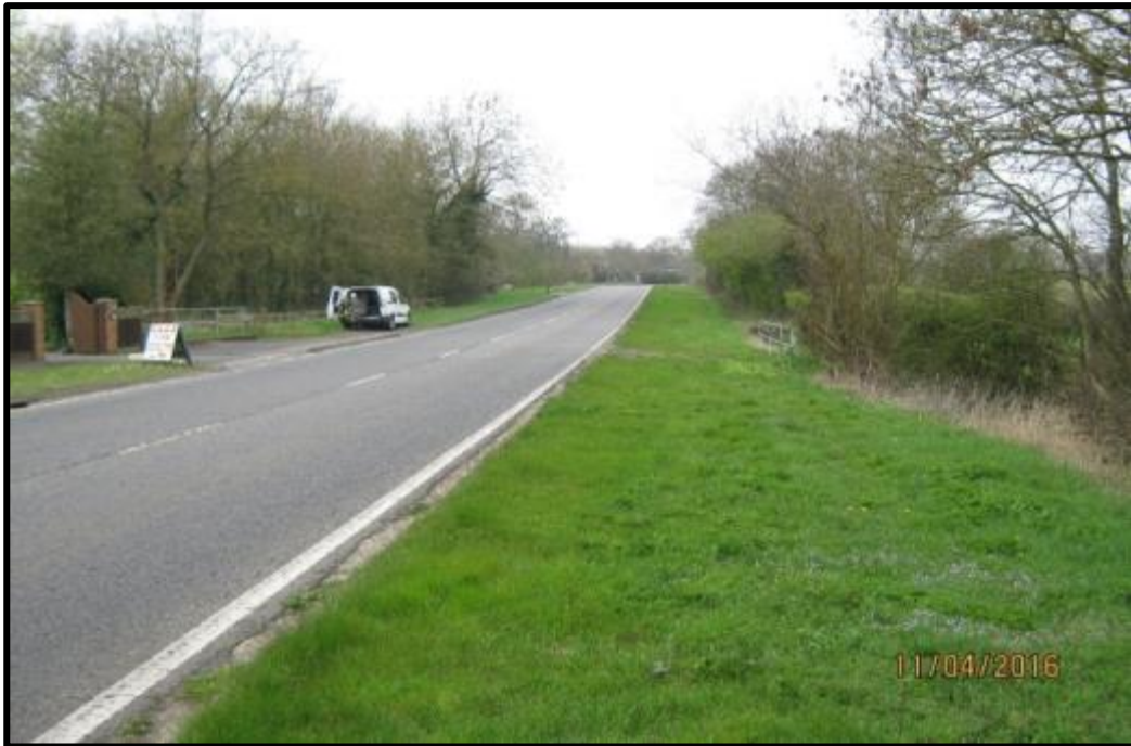
Looking West towards the bridge

Swans River Bridge (MKC No. 92461) is located at A422, Newport Road, (MK16 9JW), over Chicheley Brook between Chicheley and Astwood.