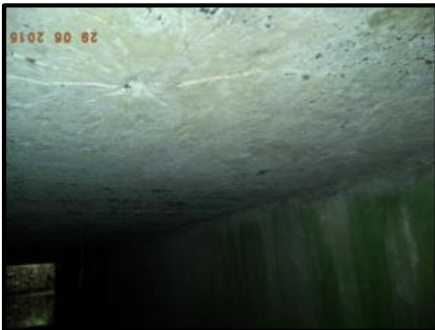
Reinforced concrete slab (North Side)