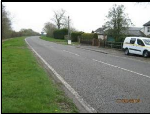
Looking East towards bridge