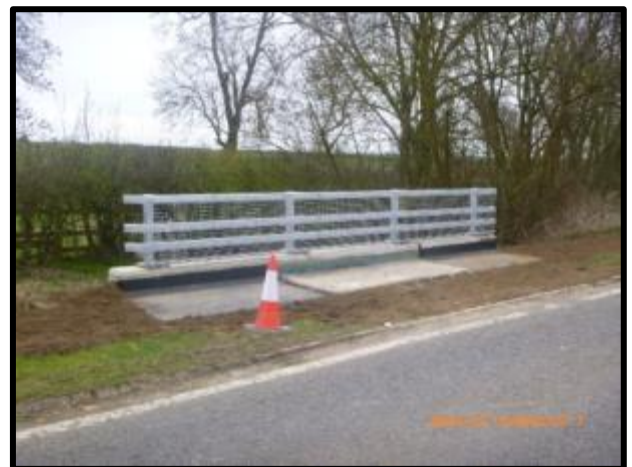
New steel parapet