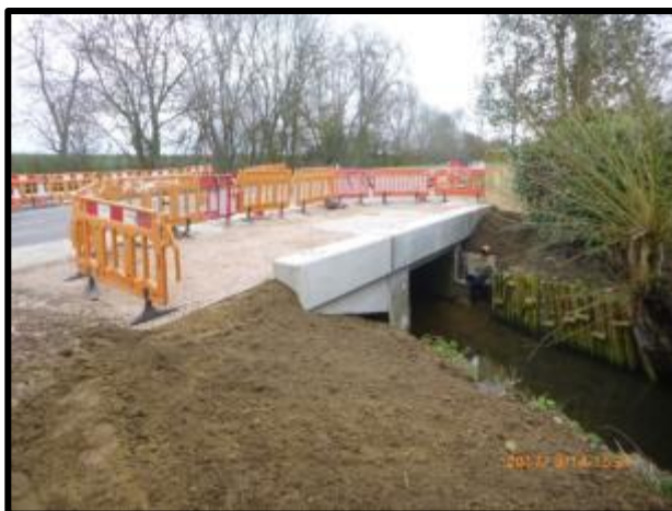
New parapet beam