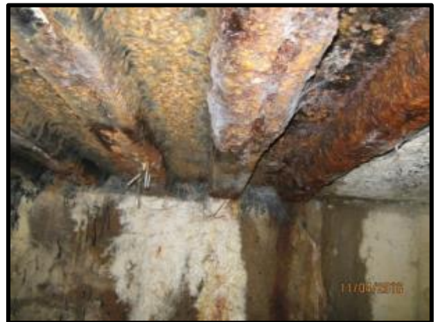
Steel Trough deck (South Side)