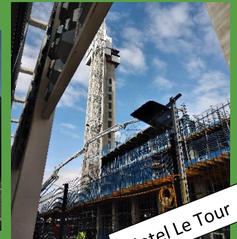
Hotel Le Tour