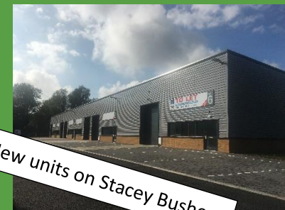
New units on Stacey Bushes

Notable Developments that have started or completed in quarter 1&2 include: