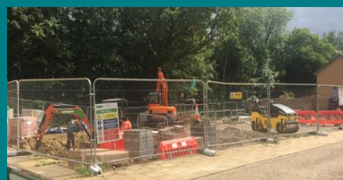
New Houses in Fishermead

Social Rent: 10 Affordable Rent: 110 Shared Ownership: 96 Discount Market Rent: 0