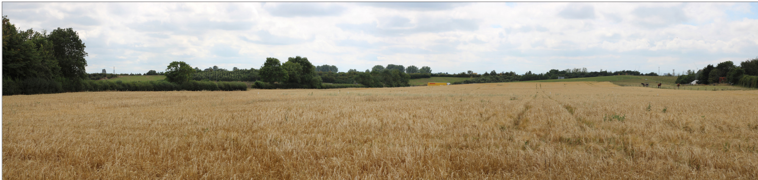
PHOTOGRAPH – VIEWPOINT S11

VIEW LOOKING NORTH-EAST FROM WITHIN THE SITE. ARABLE LAND DOMINATES THE FOREGROUND WITH WITH VIEWS OF ST. MARY’S CHURCH, CHURCH FARM AND HOUSING ON NEWPORT ROAD EVIDENT IN THE DISTANCE. INTERNAL TREE BELTS ARE SEEN TO THE LEFT AND RIGHT OF THIS VIEW.