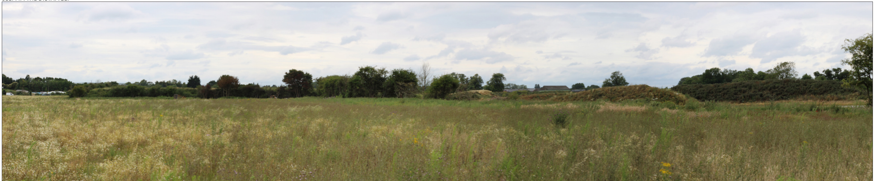
PHOTOGRAPH – VIEWPOINT S39 VALUE: LOW

VIEW LOOKING EAST OVER THE OUZEL VALLEY FLOOR FROM FOOTPATH 14 THAT LINKS MILTON KEYNES AND NEWPORT PAGNELL. A FLAT FIELD OF ROUGH GRASSLAND, RUDERALS AND SCRUB DOMINATES THE FOREGROUND. THE SITE'S WEST FACING SLOPES AND SKYLINE VIEWS OF ST. MARY'S CHURCH ARE SEEN IN THE DISTANCE.