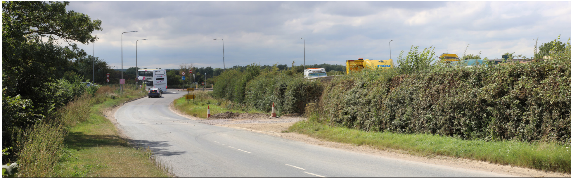
PHOTOGRAPH – VIEWPOINT S13 VALUE: LOW

VIEW LOOKING NORTH-WEST ALONG NEWPORT ROAD TOWARDS THE A509 JUNCTION THAT IS EVIDENT IN THE MIDDLE DISTANCE. HEDGEROWS DEFINED THE INTERNAL FIELD BOUNDARIES AND OBSCURE LOCALISED VIEWS ACROSS THE SITE. THE HEDGEROW THAT DEFINES THE A509 OBSCURE DISTANT VIEWS ACROSS THE SITE