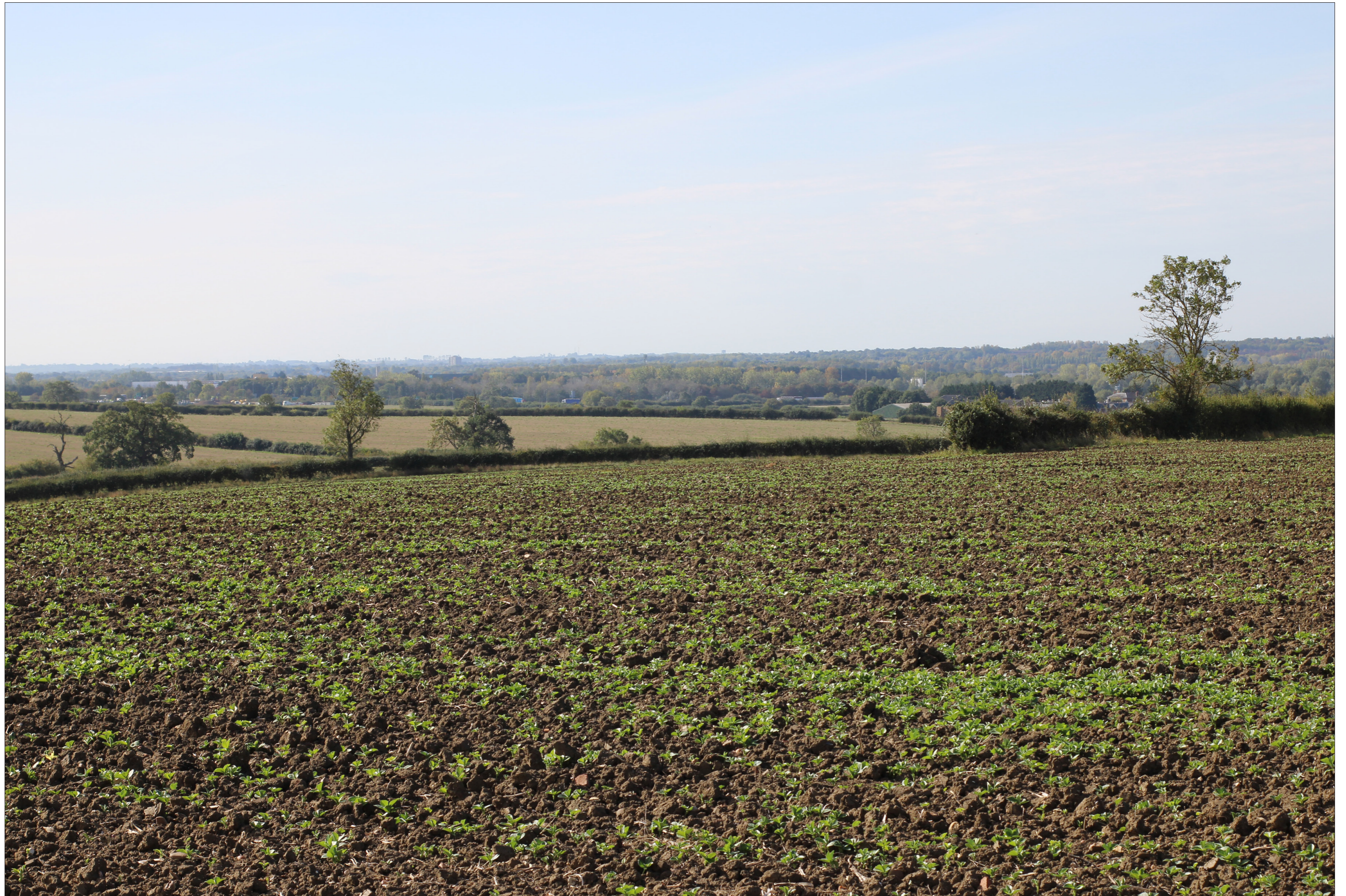
PHOTOGRAPH – VIEWPOINT L2