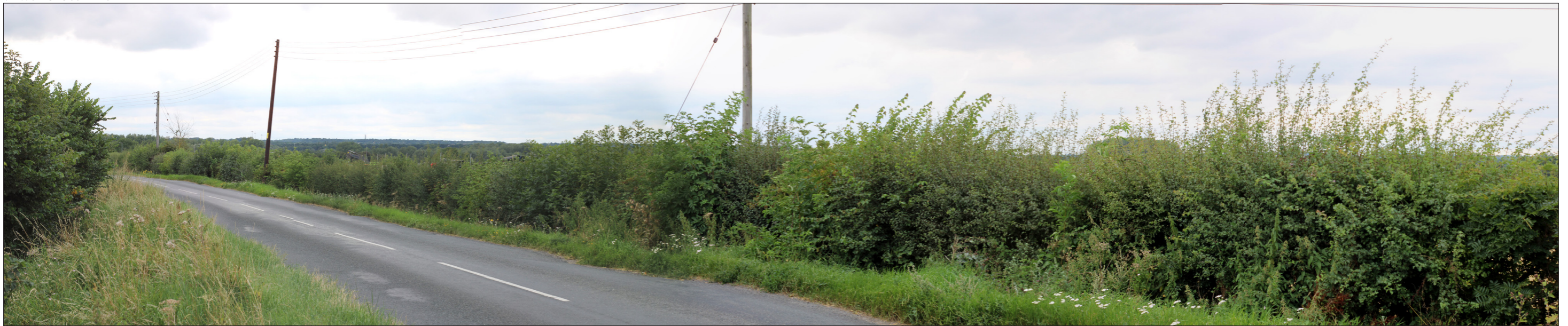
PHOTOGRAPH – VIEWPOINT S14 VALUE: LOW

VIEW LOOKING NORTH-WEST ALONG NEWPORT ROAD TOWARDS THE A509 JUNCTION THAT IS EVIDENT IN THE MIDDLE DISTANCE. HEDGEROWS DEFINED THE INTERNAL FIELD BOUNDARIES AND OBSCURE LOCALISED VIEWS ACROSS THE SITE. THE HEDGEROW THAT DEFINES THE A509 OBSCURE DISTANT VIEWS ACROSS THE SITE