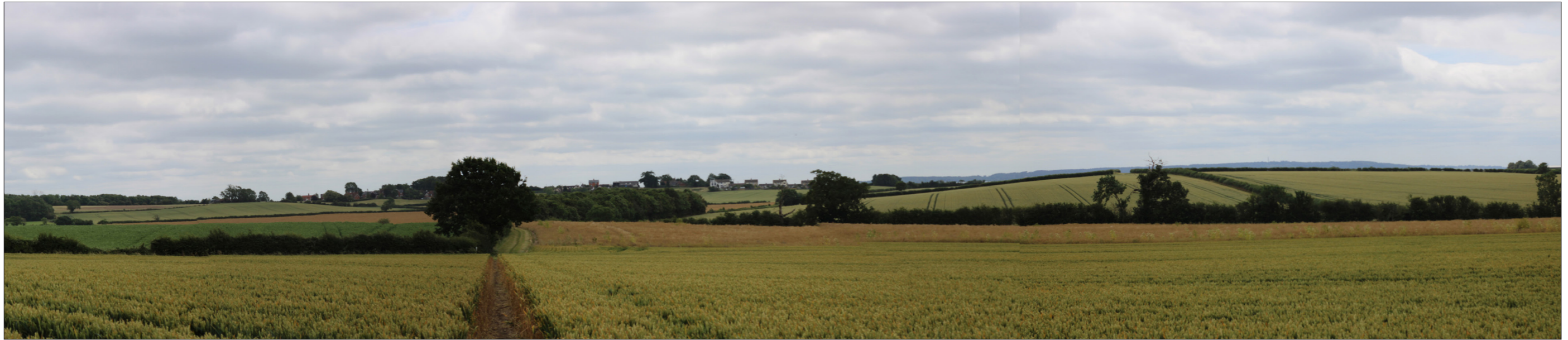
PHOTOGRAPH – VIEWPOINT S25 VALUE: MEDIUM VIEW LOOKING SOUTH-EAST FROM FOOTPATH 17, WHICH JOINS BRIDLEWAY 3 TO MOULSOE. VIEWS EXTEND FROM THE TICKFORD RIDGE OVER THE MOULSOE GAP TO MOULSOE. IN THE MIDDLE DISTANCE THE MOULSOE RIDGE AND A WOODLAND COPSE ON THE SITE'S NORTH-EASTERN BOUNDARY ARE VISIBLE.