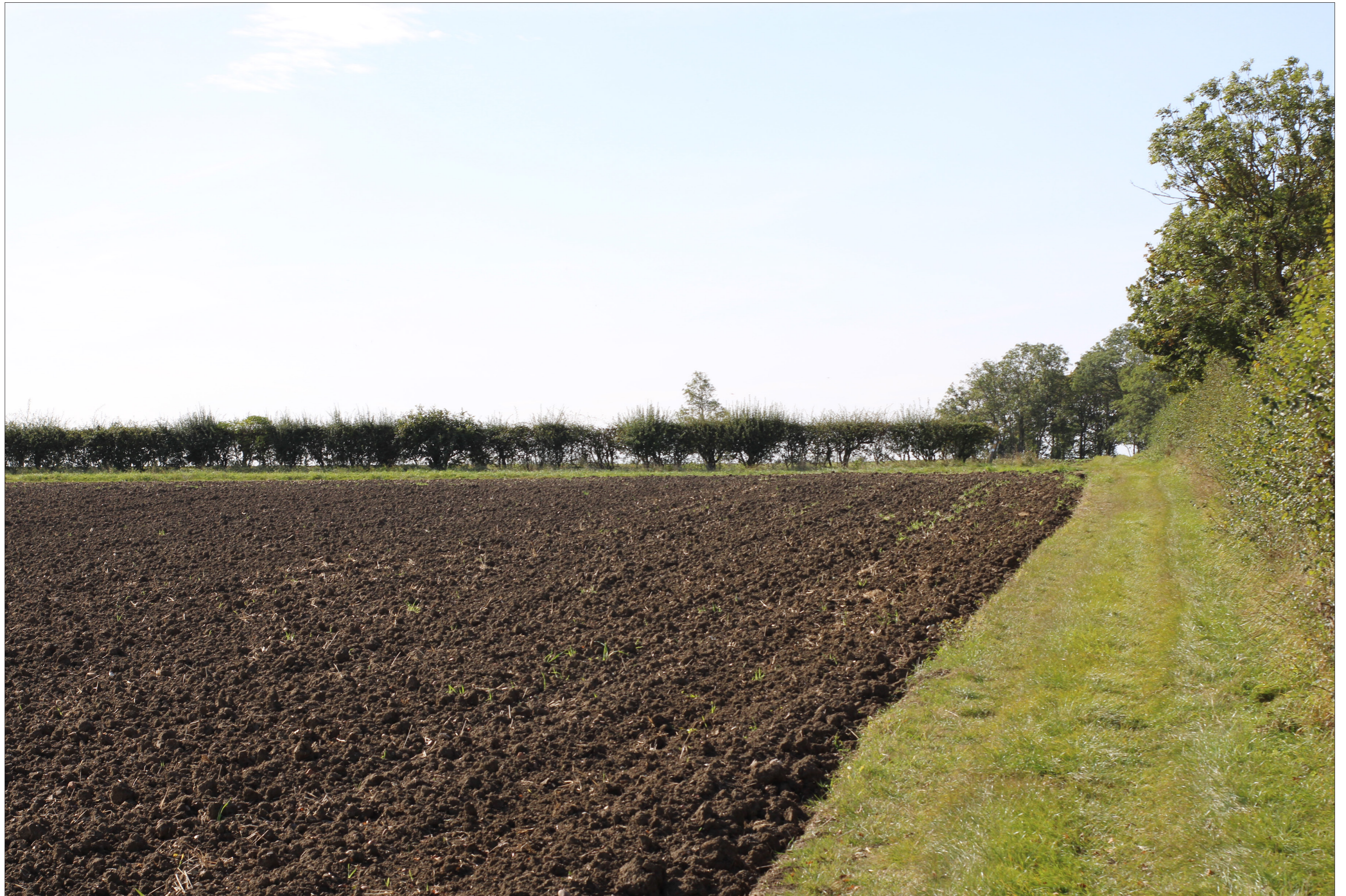
PHOTOGRAPH – VIEWPOINT L1