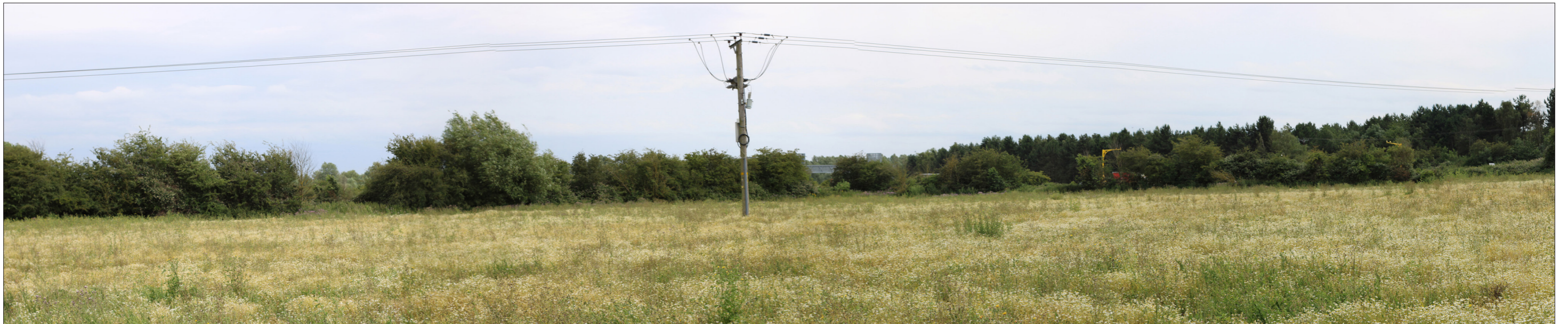
PHOTOGRAPH – VIEWPOINT S36 VALUE: LOW

VIEW LOOKING NORTH-WEST BEYOND THE LINE OF POPLARS. FIELDS OF PASTURE ARE PUNCTUATED BY VEGETATION ALONGSIDE THE OUZEL.