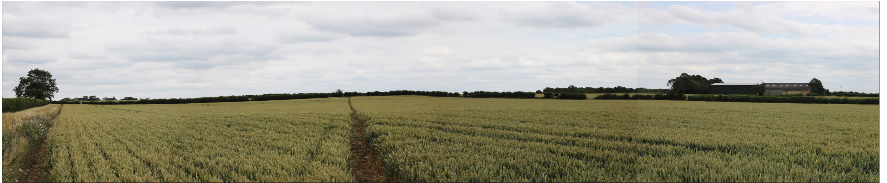
PHOTOGRAPH – VIEWPOINT S16 VALUE: MEDIUM

VIEW LOOKING EAST FROM FOOTPATH 2 THAT EXTENDS FROM THE A509 LONDON ROAD TO NEWPORT ROAD. SLOPING ARABLE FIELDS DOMINATE THE VIEW. TO THE LEFT OF THE PANORAMA THE TOWER OF ST. MARY'S CHURCH IS SEEN BEYOND THE MOULSOE RIDGE (WITHIN THE SITE). RIGHT OF THE VIEW ARE FARM BUILDINGS/ STORAGE SHEDS ALONGSIDE NEWPORT ROAD.