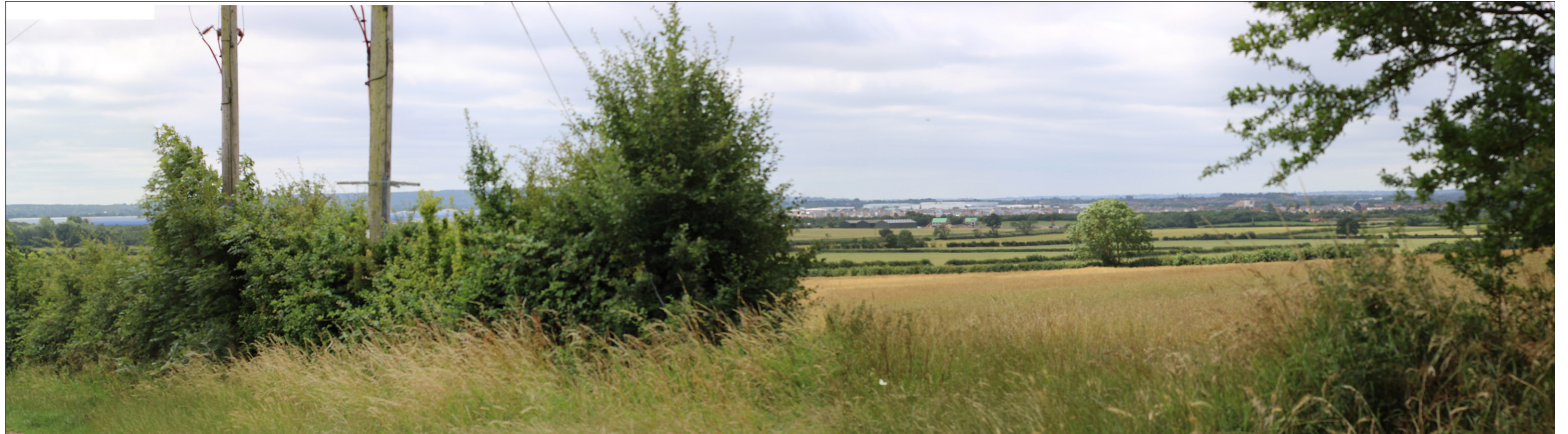
PANORAMA OF VIEWPOINT L5 ILLUSTRATING CONTEXT