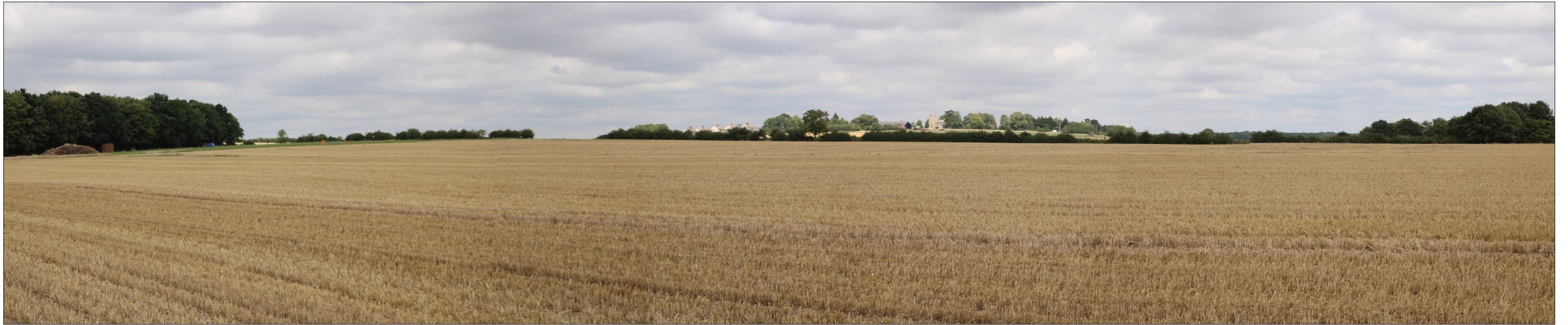
PHOTOGRAPH – VIEWPOINT S10

VIEW LOOKING NORTH-EAST FROM WITHIN THE SITE. ARABLE LAND DOMINATES THE FOREGROUND WITH WITH VIEWS OF ST. MARY’S CHURCH, CHURCH FARM AND HOUSING ON NEWPORT ROAD EVIDENT IN THE DISTANCE. INTERNAL TREE BELTS ARE SEEN TO THE LEFT AND RIGHT OF THIS VIEW.