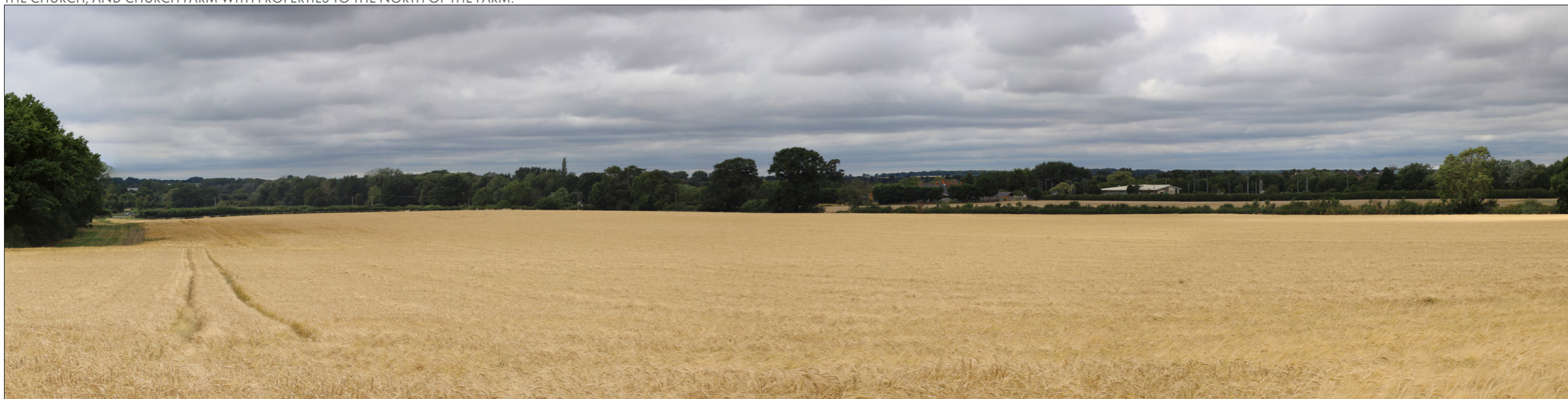
PHOTOGRAPH – VIEWPOINT S21 VIEW LOOKING NORTH-WEST. ARABLE FIELDS SLOPE TO VEGETATION ALONGSIDE THE A509. NEWPORT STABLES AND A CAR SHOW ROOM ARE VISIBLE AT THE A509/A22 JUNCTION. IN THE DISTANCE THE EDGE OF NEWPORT IS SEEN BEYOND ROADSIDE TREE COVER.