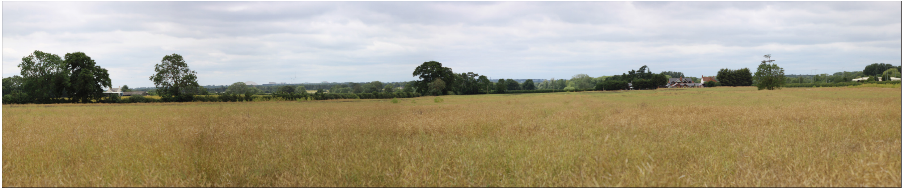
PHOTOGRAPH – VIEWPOINT S22 VALUE: MEDIUM

VIEW LOOKING SOUTH-WEST FROM FOOTPATH 17 THAT EXTENDS TO THE A509. MIDDLE DISTANT VIEWS EXTEND TO NEWPORT STABLES AT THE A509/A422 JUNCTION (RIGHT) AND FARM COTTAGES ON THE A509 (LEFT). THE MILTON KEYNES SNOWDOME AND SKYLINE IS SEEN IN THE FAR DISTANCE.