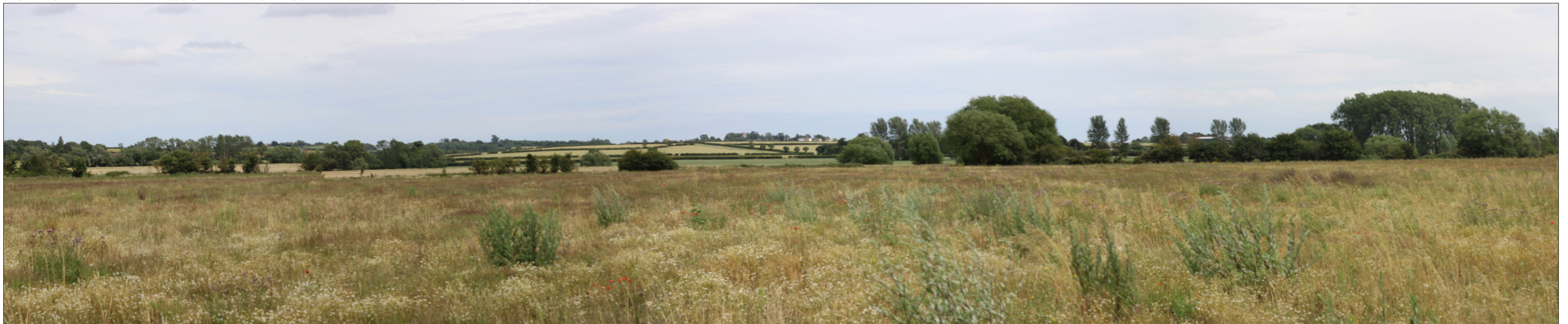
PHOTOGRAPH – VIEWPOINT S38 VALUE: MEDIUM

VIEW LOOKING WEST TOWARDS THE SITE'S WESTERNMOST CORNER FROM FOOTPATH 14 THAT LINKS MILTON KEYNES AND NEWPORT PAGNELL. ROUGH GRASSLAND, RUDERALS AND SCRUB DOMINATES THIS FLAT FIELD. VIEWS EXTEND TO THE M1 CORRIDOR, WILLEN ROAD BRIDGE AND ADJACENT VEGETATION. PARAPHERNALIA ASSOCIATED WITH CALDECOT FARM IS SEEN TO THE RIGHT OF THE PHOTOGRAPH.