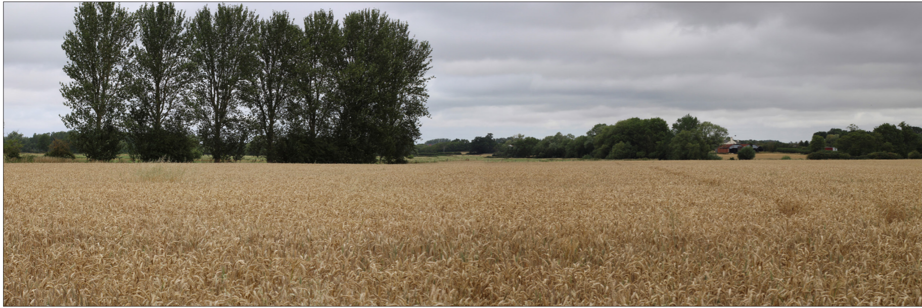
PHOTOGRAPH – VIEWPOINT S34

VIEW LOOKING SOUTH-EAST TOWARDS HEDGEROW ALONGSIDE THE A509 LONDON ROAD CORRIDOR. A LARGE FIELD OF PASTURE DOMINATES THE VIEW. COTTAGES SOUTH OF MOULSOE BUILDINGS FARMHOUSE ARE SEEN TO THE LEFT.