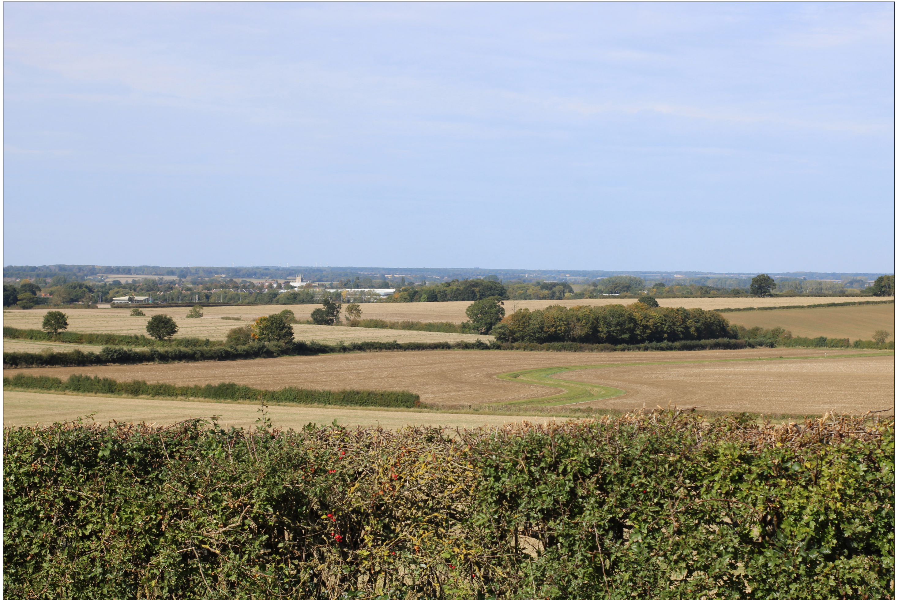
PHOTOGRAPH – VIEWPOINT L4