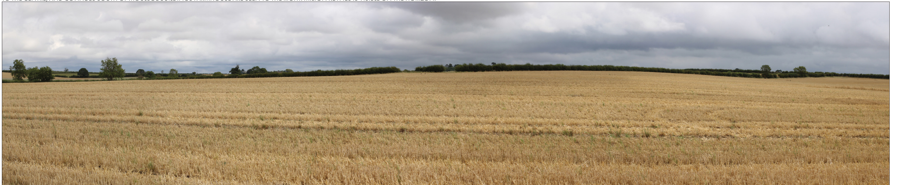
PHOTOGRAPH – VIEWPOINT S18

VIEW LOOKING WEST FROM FOOTPATH 2 THAT EXTENDS FROM THE A509 LONDON ROAD TO NEWPORT ROAD. THE VIEW IS FORESHORTENED BY AN INTERNAL BOUNDARY HEDGEROW. IN THIS VIEW THE NEWPORT ROAD/A509 LONDON ROAD JUNCTION IS VISIBLE TO THE LEFT; A GANTRY ON THE M1 IS SEEN TO THE CENTRE; AND COTTAGES SOUTH OF MOULSOE BUILDINGS FARMHOUSE ARE SEEN TO THE RIGHT. MILTON KEYNES IS VISIBLE ON THE HORIZON.