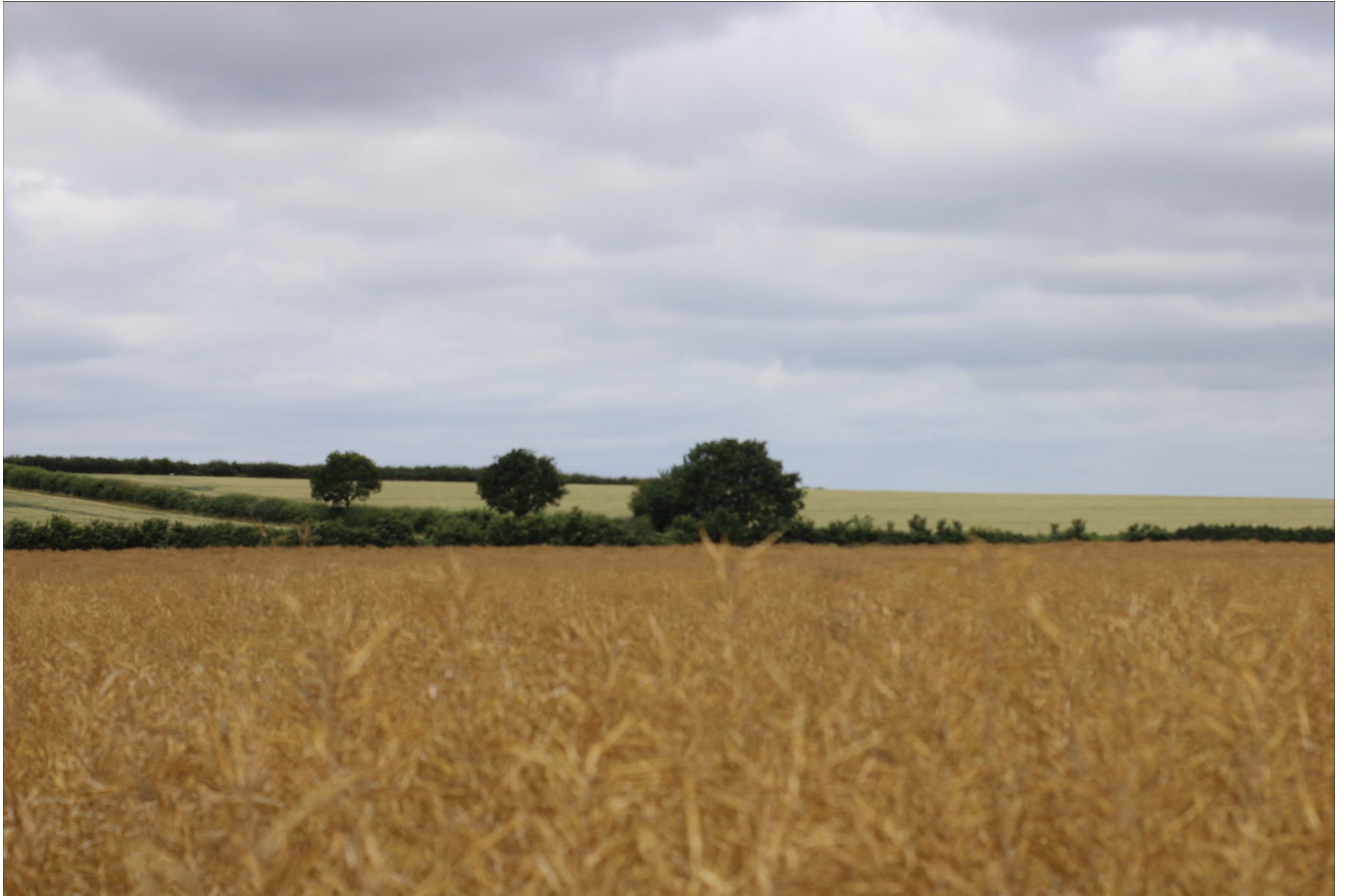
PHOTOGRAPH – VIEWPOINT L3