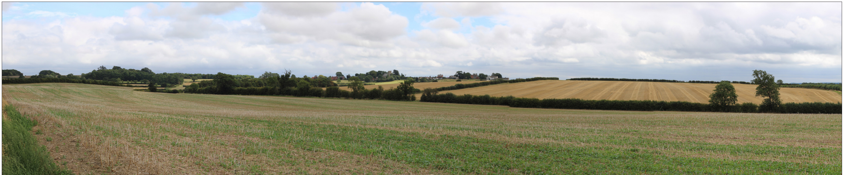
PHOTOGRAPH – VIEWPOINT S20 VIEW LOOKING SOUTH EAST. FROM THIS ELEVATED POSITION AT THE END OF THE TICKFORD RIDGE VIEWS EXTEND BEYOND THE MOULSOE GAP TO MOULSOE. FROM LEFT TO RIGHT THE VIEW INCLUDES THE OLD SCHOOL HOUSE AND ADJACENT BUILDINGS; ST. MARY'S CHURCH WITH PROPERTIES NORTH OF THE CHURCH; AND CHURCH FARM WITH PROPERTIES TO THE NORTH OF THE FARM.