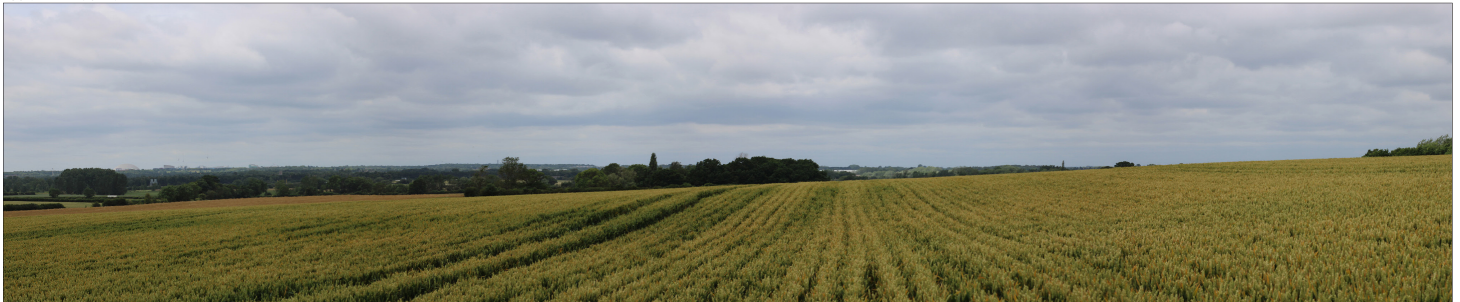
PHOTOGRAPH – VIEWPOINT S26 VALUE: MEDIUM VIEW LOOKING SOUTH-WEST FROM FOOTPATH 17, WHICH JOINS BRIDLEWAY 3 TO MOULSOE. FROM THIS ELEVATED POSITION, DISTANT VIEWS OF MILTON KEYNES ARE SEEN IN THE DISTANCE WITH THE SNOWDOME BREAKING THE SKYLINE.