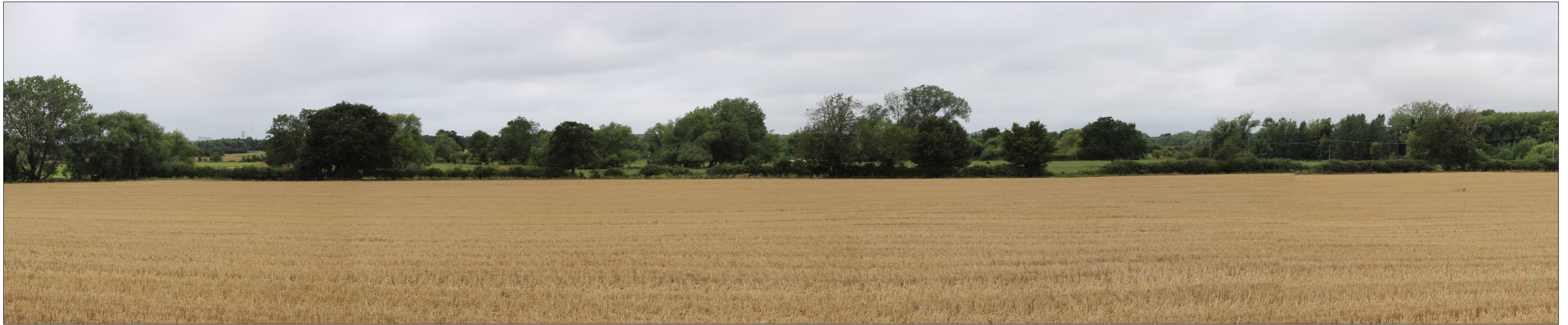
PHOTOGRAPH – VIEWPOINT S31

VIEW LOOKING WEST TOWARDS HEDGEROW FORMING PART OF THE SITE'S NORTH-WESTERN BOUNDARY. BEYOND THIS BOUNDARY VEGETATION ALONGSIDE THE RIVER OUZEL IS VISIBLE.