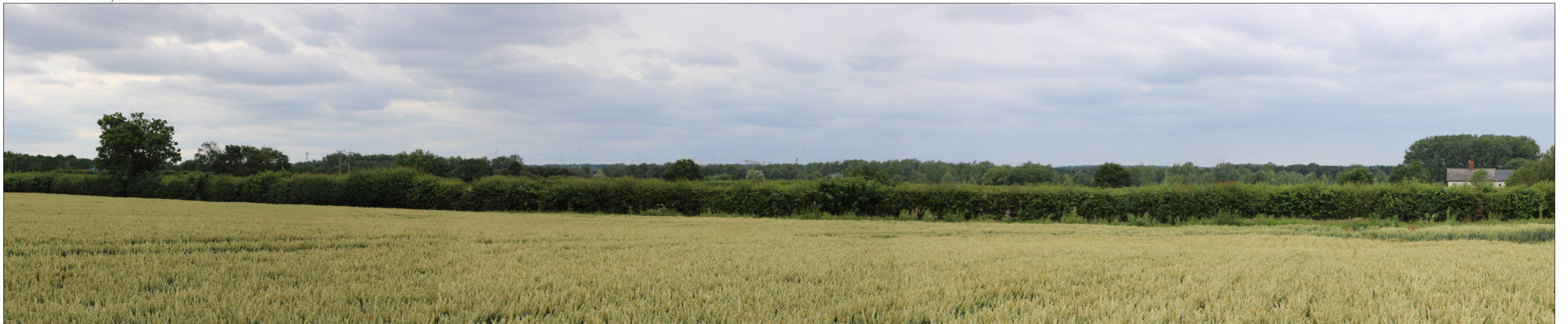
PHOTOGRAPH – VIEWPOINT S17 VALUE: LOW

VIEW LOOKING EAST FROM FOOTPATH 2 THAT EXTENDS FROM THE A509 LONDON ROAD TO NEWPORT ROAD. SLOPING ARABLE FIELDS DOMINATE THE VIEW. TO THE LEFT OF THE PANORAMA THE TOWER OF ST. MARY'S CHURCH IS SEEN BEYOND THE MOULSOE RIDGE (WITHIN THE SITE). RIGHT OF THE VIEW ARE FARM BUILDINGS/ STORAGE SHEDS ALONGSIDE NEWPORT ROAD.