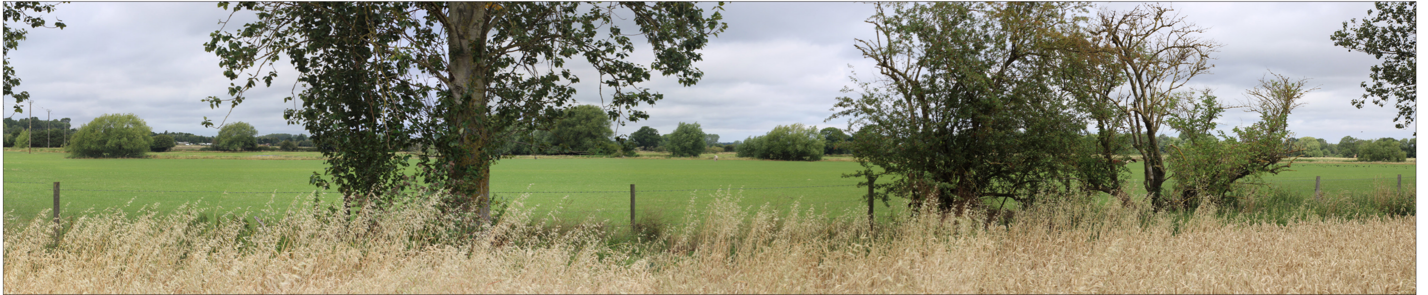
PHOTOGRAPH – VIEWPOINT S35

VIEW LOOKING SOUTH-EAST TOWARDS HEDGEROW ALONGSIDE THE A509 LONDON ROAD CORRIDOR. A LARGE FIELD OF PASTURE DOMINATES THE VIEW. COTTAGES SOUTH OF MOULSOE BUILDINGS FARMHOUSE ARE SEEN TO THE LEFT.