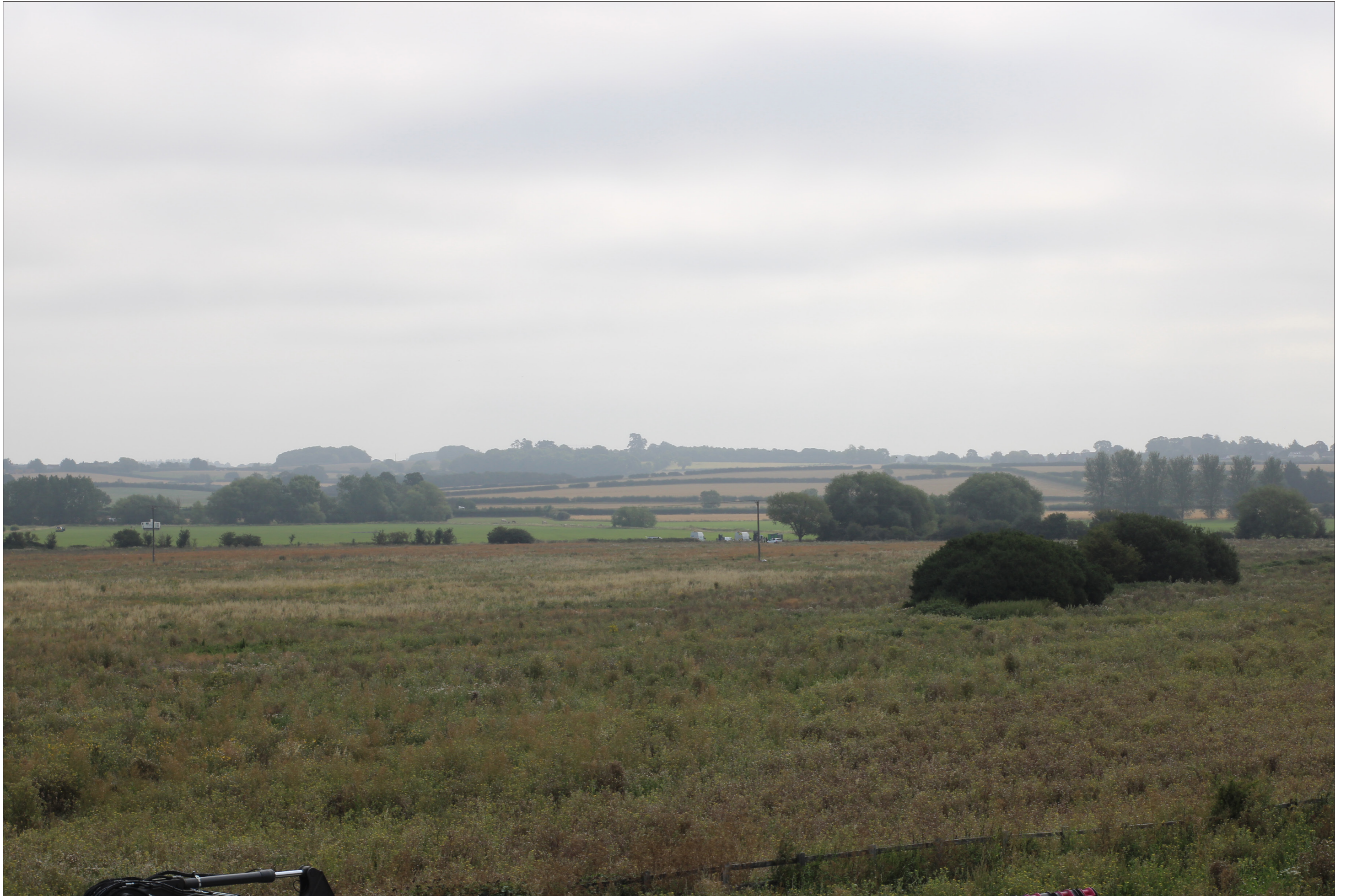
PHOTOGRAPH – VIEWPOINT L6