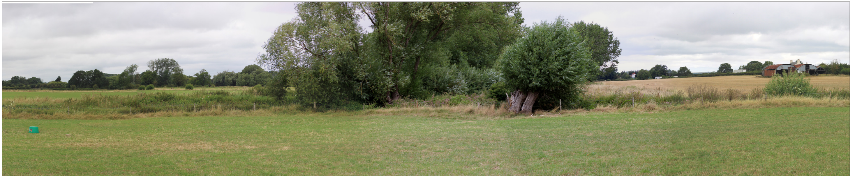
PHOTOGRAPH – VIEWPOINT S32

VIEW LOOKING WEST TOWARDS HEDGEROW FORMING PART OF THE SITE'S NORTH-WESTERN BOUNDARY. BEYOND THIS BOUNDARY VEGETATION ALONGSIDE THE RIVER OUZEL IS VISIBLE.