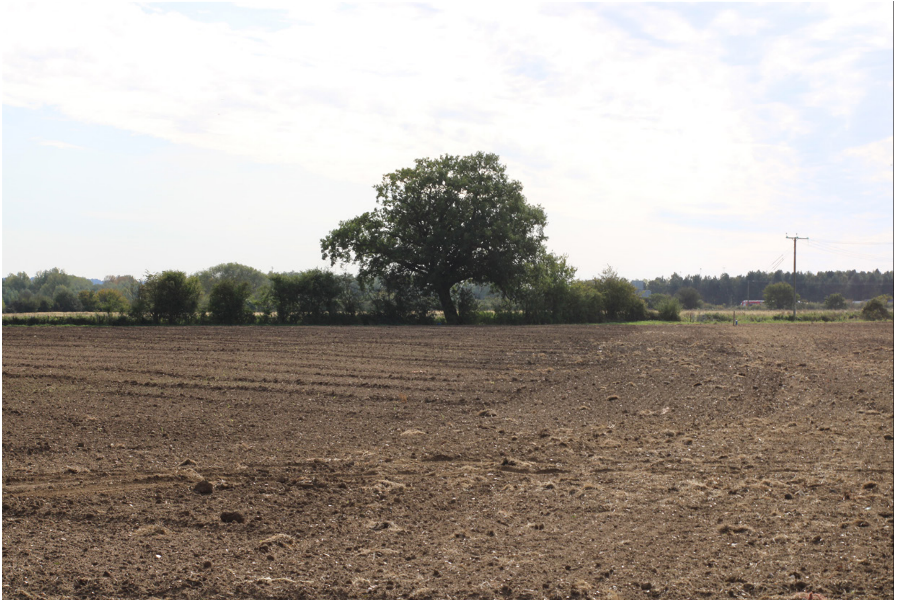
PHOTOGRAPH – VIEWPOINT L7