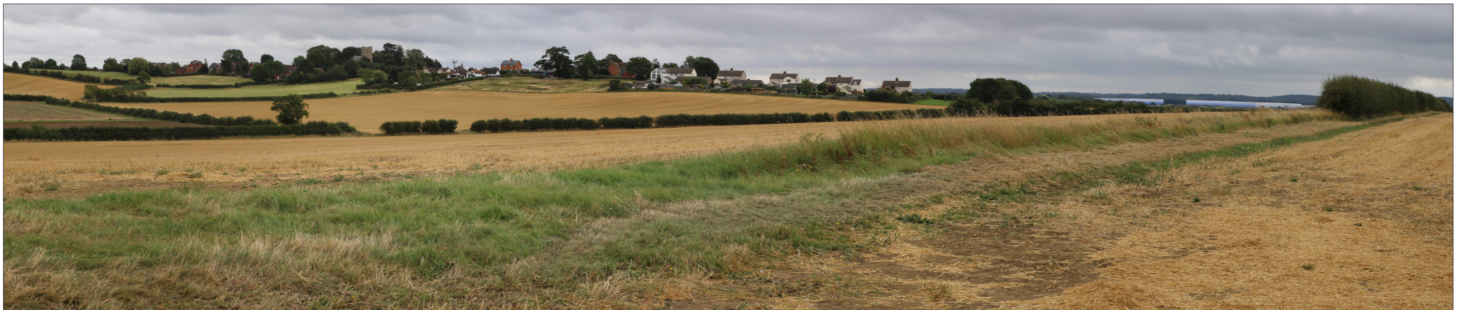
PHOTOGRAPH – VIEWPOINT S27 VIEW LOOKING SOUTH-EAST FROM THE TOP OF THE MOULSOE RIDGE WITHIN THE SITE. FROM THIS ELEVATED POSITION VIEWS EXTEND OVER THE MOULSOE BOWL TO MOULSOE VILLAGE. DISTRIBUTION SHEDS ARE VISIBLE TO THE RIGHT..