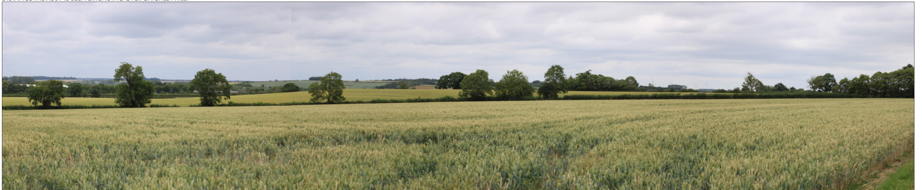
PHOTOGRAPH – VIEWPOINT S24 VALUE: MEDIUM

VIEW LOOKING NORTH-EAST FROM FOOTPATH 17 THAT EXTENDS TO THE A509. ARABLE LAND RISING OVER THE TICKFORD RIDGE (RIGHT) DOMINATES THIS VIEW. BEYOND THE SITE THERE ARE MID DISTANT VIEWS OF VEGETATION ALONGSIDE THE A509 AND NORTH CRAWLEY ROAD BRIDGE (LEFT). IN THE DISTANCE THE A509 IS SEEN EXTENDING OVER CHICHLEY HILL.