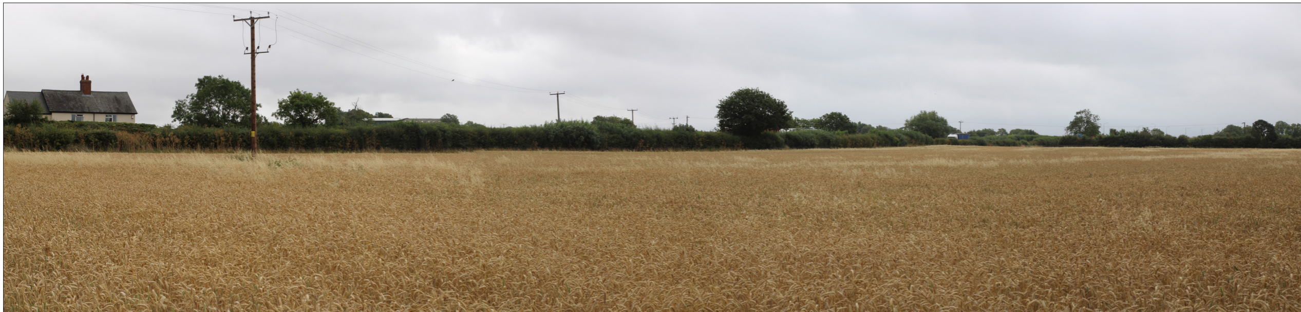
PHOTOGRAPH – VIEWPOINT S33

VIEW LOOKING NORTH. THE VEGETATION AND TREE LINED CORRIDOR OF THE RIVER OUZEL IS APPARENT WITH FIELDS OF PASTURE IN THE FOREGROUND AND TO THE WEST.