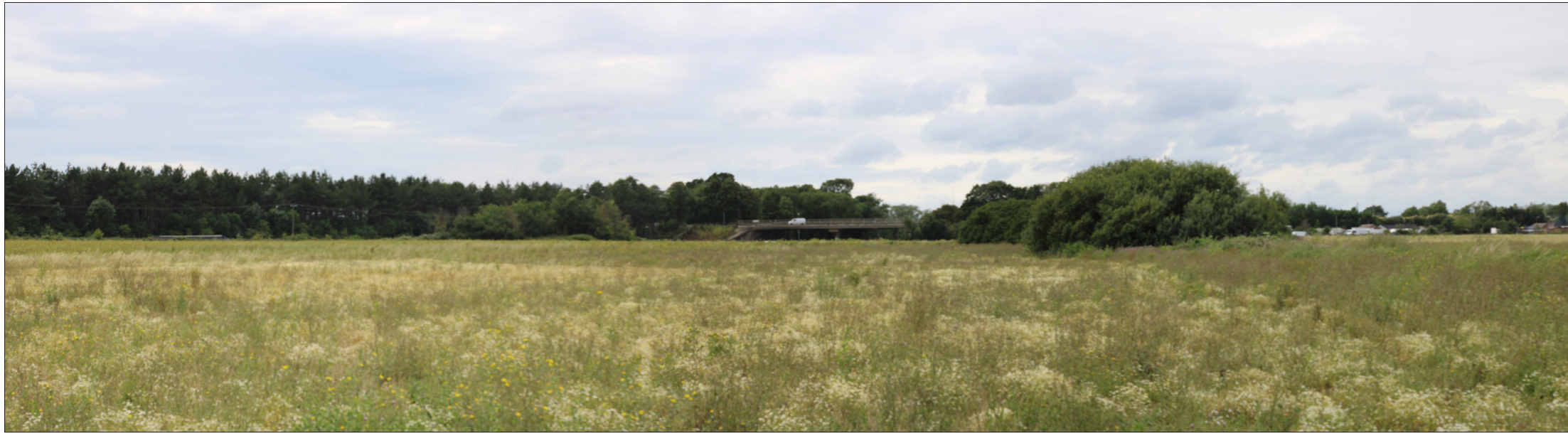
PHOTOGRAPH – VIEWPOINT S37 VALUE: LOW

VIEW LOOKING WEST TOWARDS THE SITE'S WESTERNMOST CORNER FROM FOOTPATH 14 THAT LINKS MILTON KEYNES AND NEWPORT PAGNELL. ROUGH GRASSLAND, RUDERALS AND SCRUB DOMINATES THIS FLAT FIELD. VIEWS EXTEND TO THE M1 CORRIDOR, WILLEN ROAD BRIDGE AND ADJACENT VEGETATION. PARAPHERNALIA ASSOCIATED WITH CALDECOT FARM IS SEEN TO THE RIGHT OF THE PHOTOGRAPH.