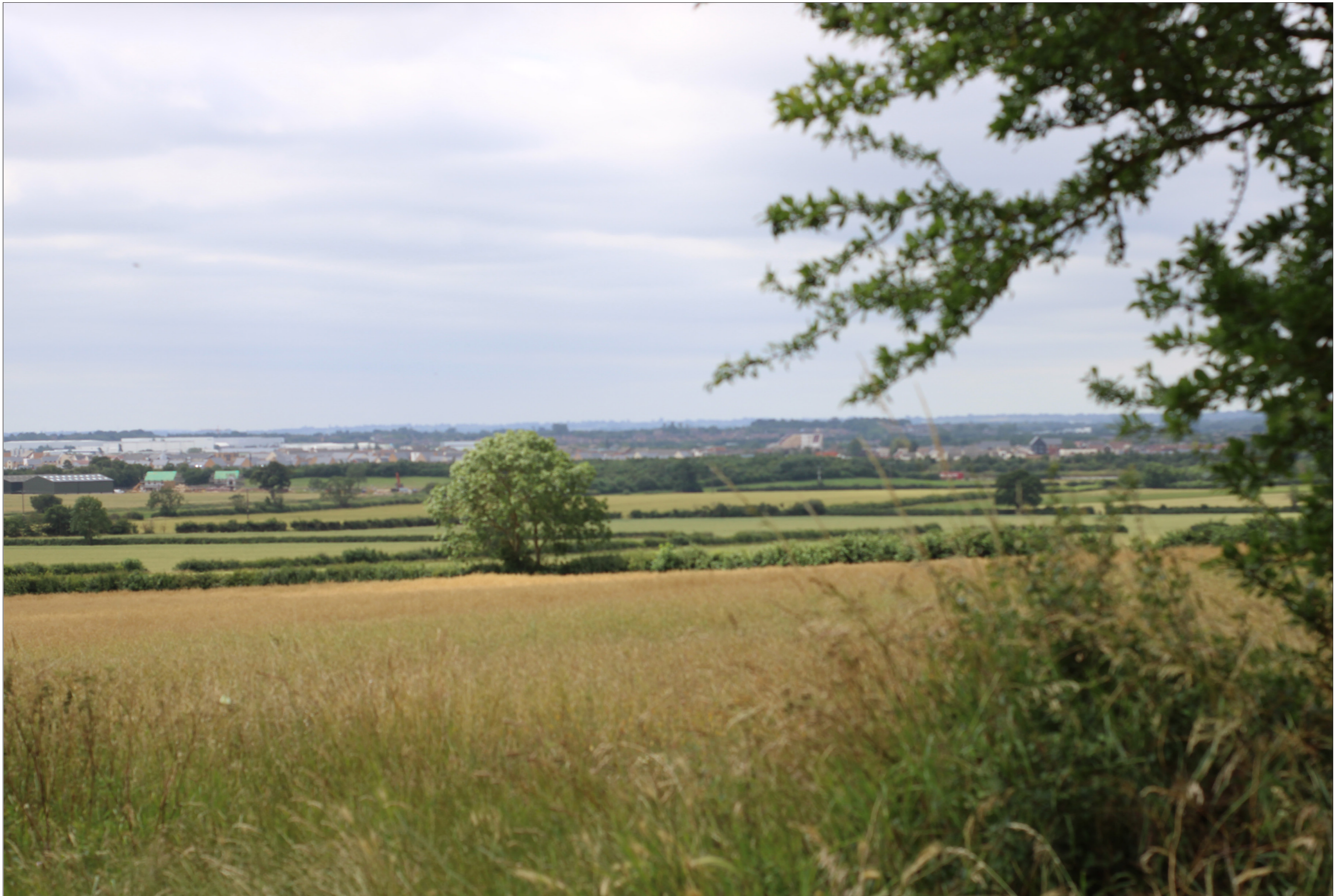
PHOTOGRAPH – VIEWPOINT L5