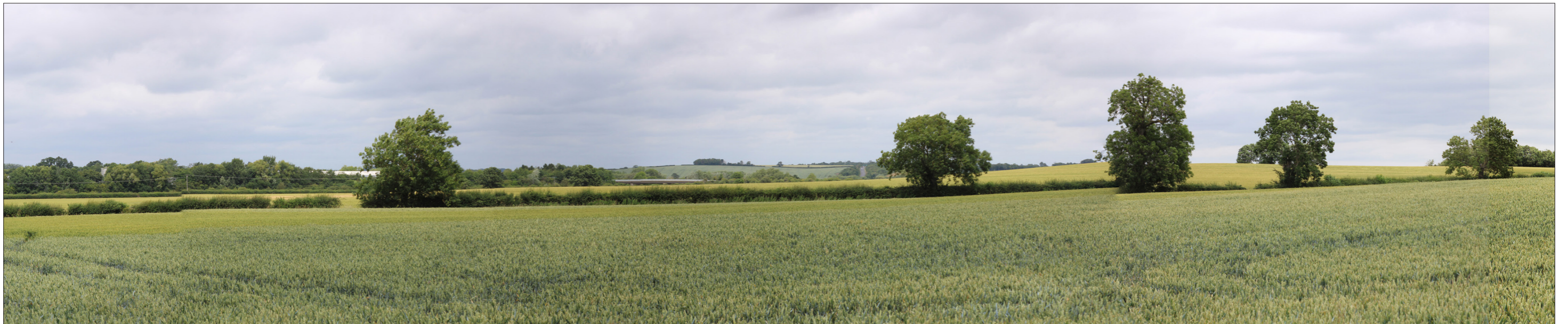
PHOTOGRAPH – VIEWPOINT S23 VALUE: MEDIUM

VIEW LOOKING SOUTH-WEST FROM FOOTPATH 17 THAT EXTENDS TO THE A509. MIDDLE DISTANT VIEWS EXTEND TO NEWPORT STABLES AT THE A509/A422 JUNCTION (RIGHT) AND FARM COTTAGES ON THE A509 (LEFT). THE MILTON KEYNES SNOWDOME AND SKYLINE IS SEEN IN THE FAR DISTANCE.