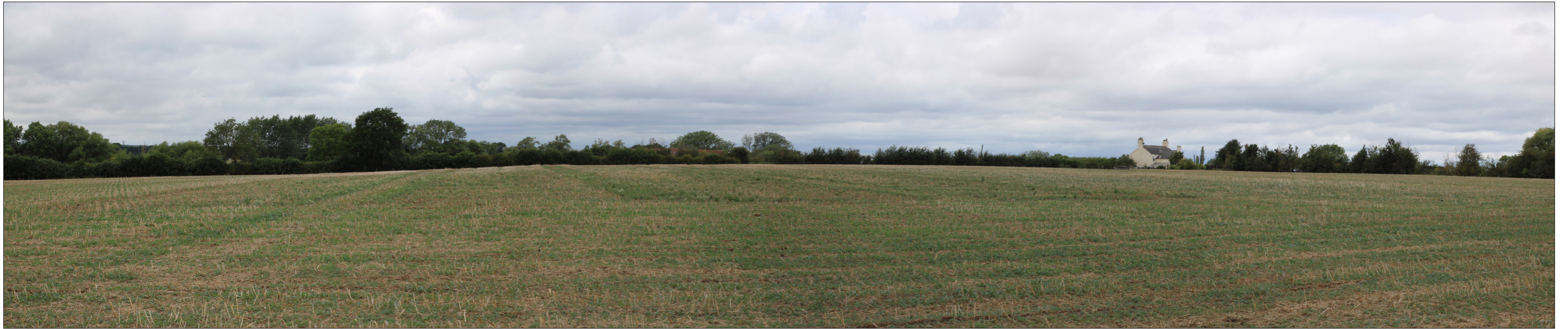
PHOTOGRAPH – VIEWPOINT S19 VIEW LOOKING WEST. ARABLE FIELDS EXTEND TO VEGETATION ALONGSIDE THE A509 LONDON ROAD. FARM COTTAGES AT 27 AND 29 LONDON ROAD ARE SEEN TO THE RIGHT.