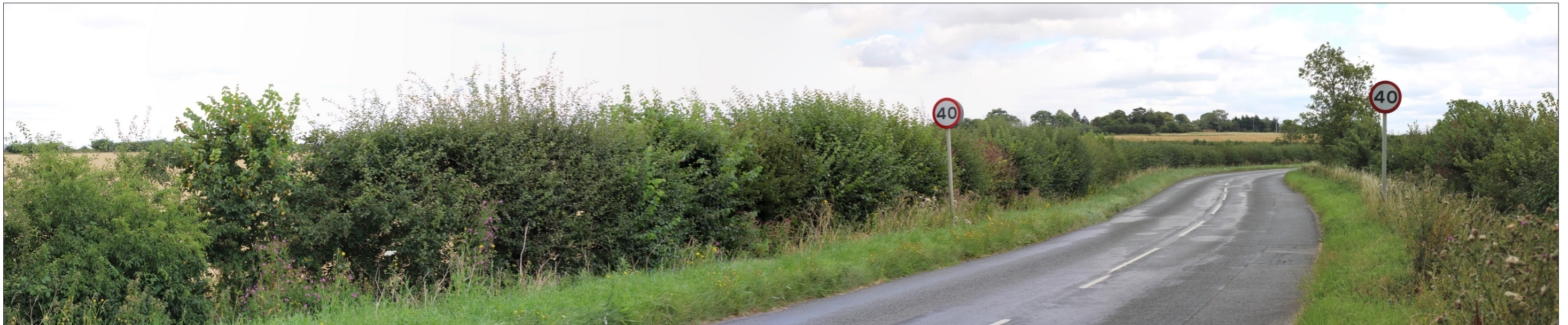
PHOTOGRAPH – VIEWPOINT S15 VALUE: MEDIUM

VIEWPOINT 14 LOOKING NORTH-WEST FROM NEWPORT ROAD. THE SITE IS GLIMPSED BEYOND ROADSIDE AND INTERNAL HEDGEROW WITH THE A509 EVIDENT IN THE MIDDLE DISTANCE.