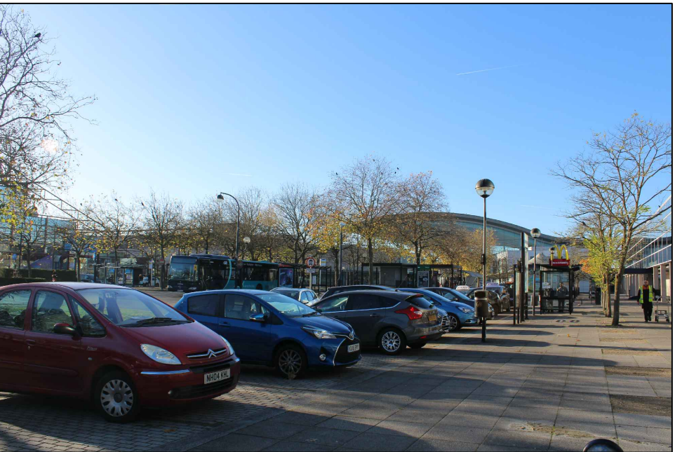
Existing view from point 2