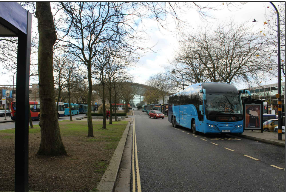
Existing view from point 1

Total area of space 3000m2 (Inner square 625m2)