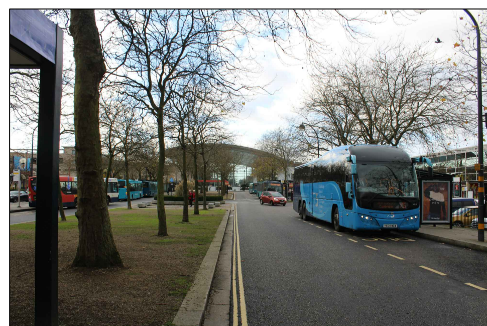
Existing view from point 1

Total area of space 3000m2 (Inner square 625m2)