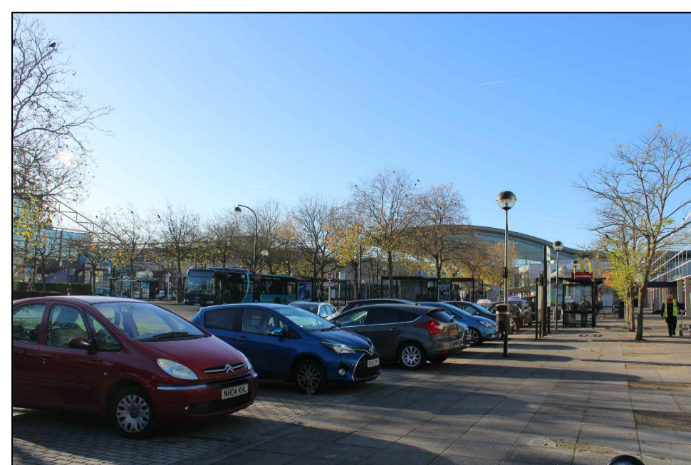
Existing view from point 2