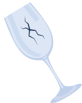
Broken glass (please wrap in newspaper or bubble wrap to avoid injury)