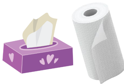
Tissues and hand towels