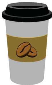
Disposable coffee cup