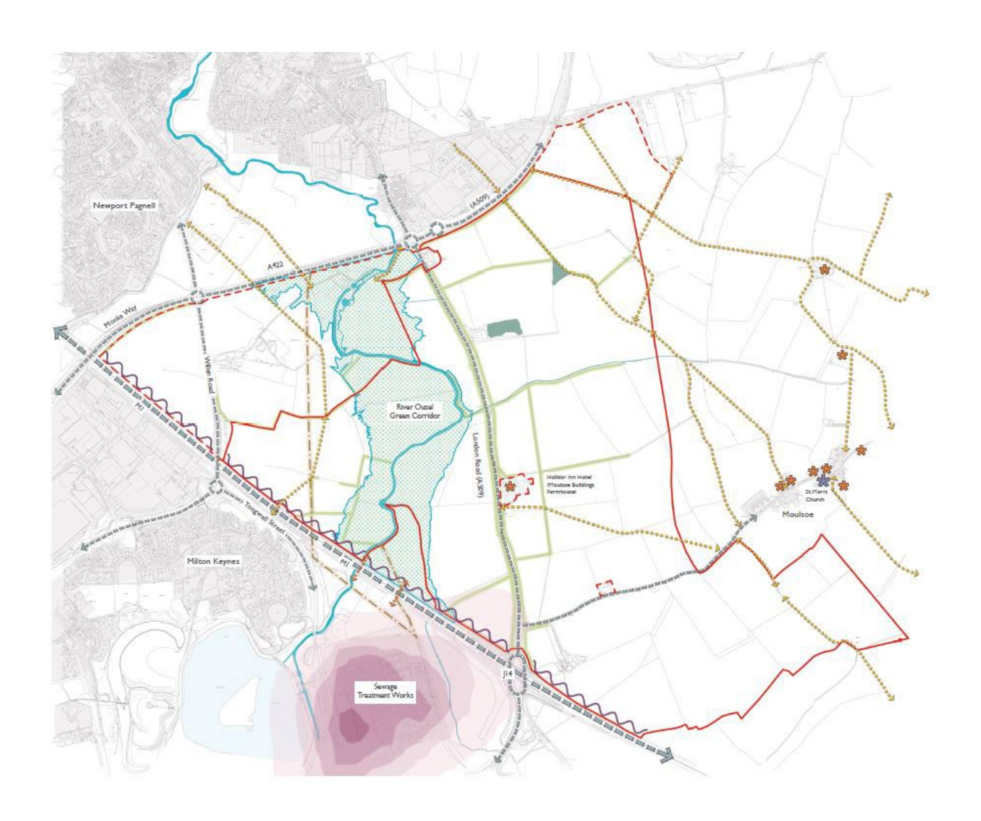
APPENDIX 3: Milton Keynes East Strategic Urban Extension: Extent of River Ouzel Floodplain