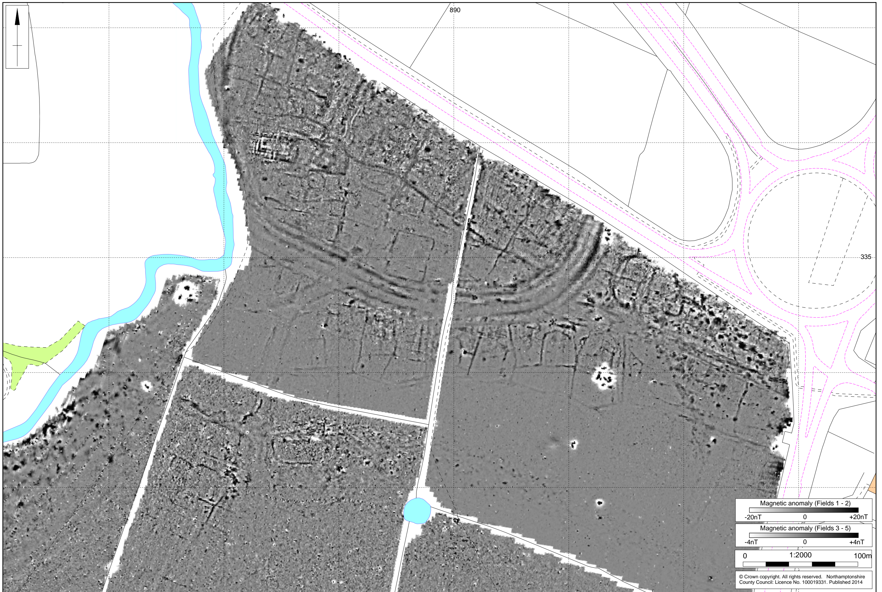
Scale 1:2500 (A3)