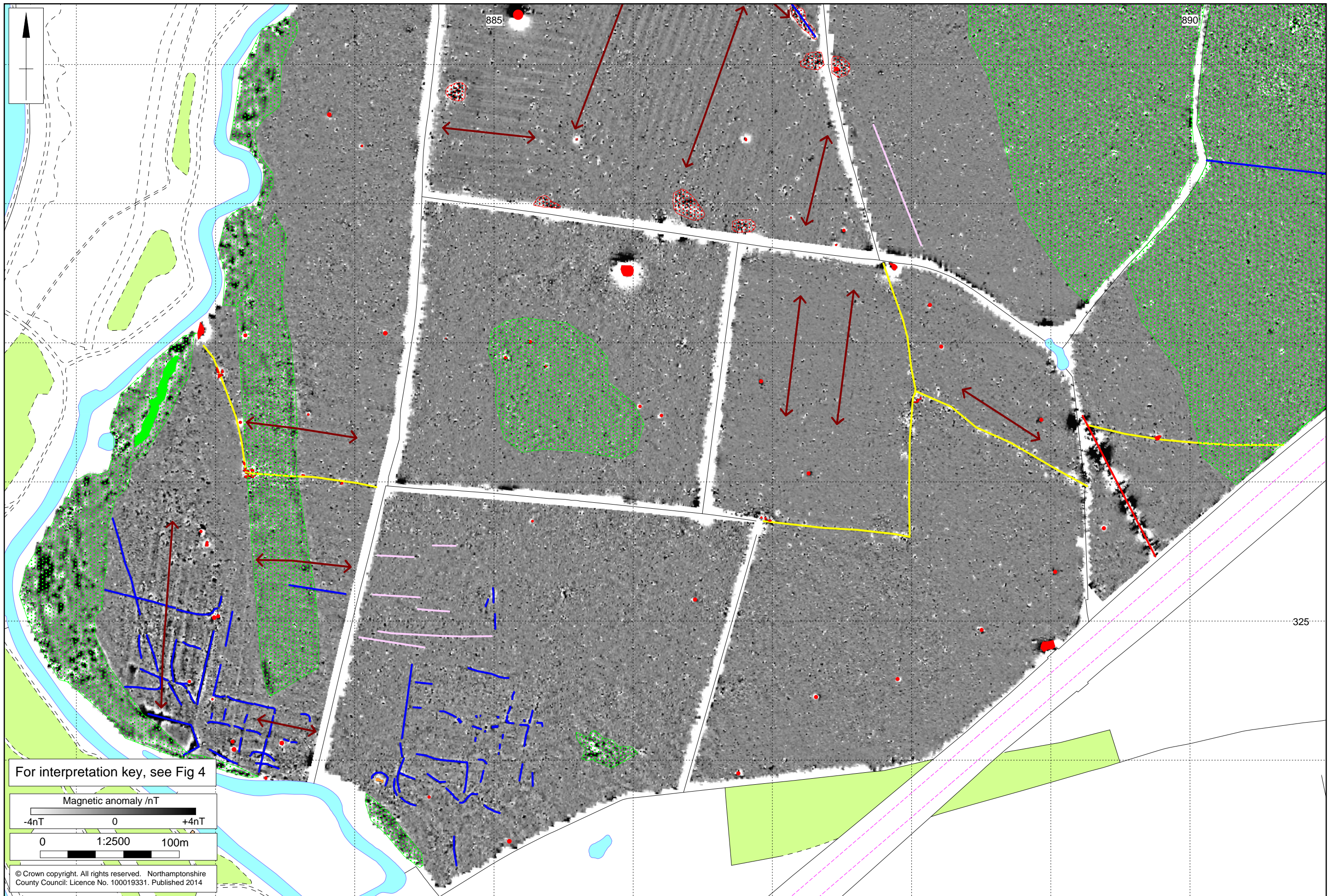
Scale 1:2500 (A3)