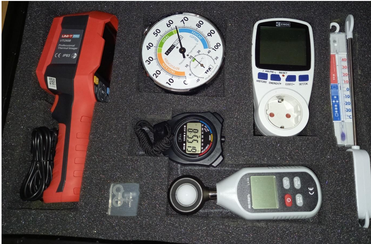
Picture 1: Carbon reduction suitcase for Citizens to detect losses and irregularities in their homes

In the RAP (Regional Action Plan), Energap focused on Working field 5 - Informed and active citizens -community. Through the activities in the RAP, they defined the methods and tools for active engagement of different target groups of citizens in planning and implementing the actions. The solutions will include ICT technologies and instruments as well as some basic face to face measures, for citizen to challenge the engagement.