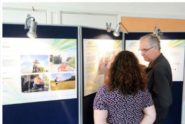
Local residents talk to representatives of the consortium at the public exhibition Salden Chase development will have on doctors and roads in the area.