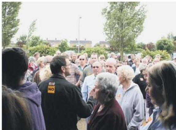
SILENT PROTEST: Protesters make themselves known at the exhibition