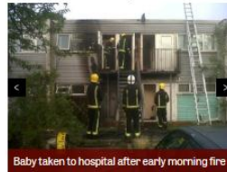
Baby taken to hospital after early morning fire