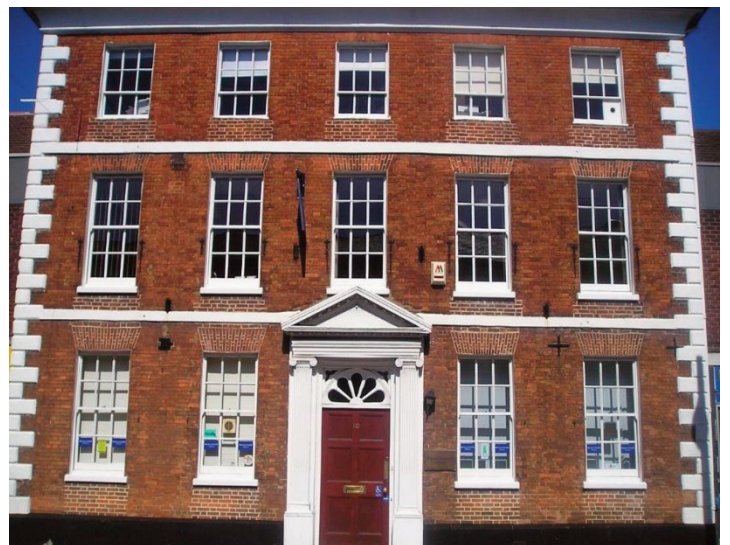
Entrances to buildings should be obvious