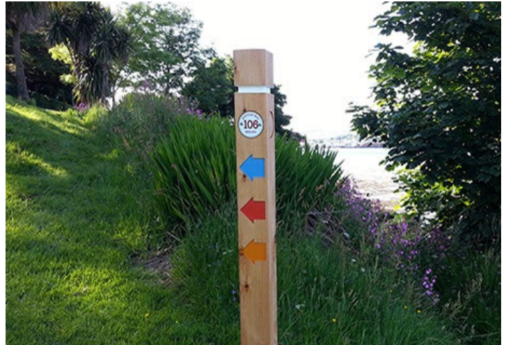
Waymarked circular walking routes