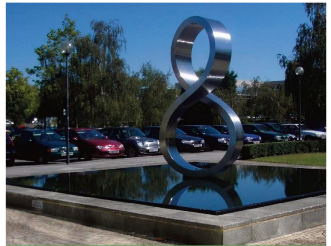
Public art can help with wayfinding