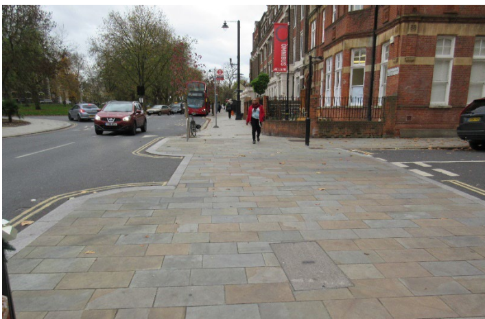
Continuous pedestrian footways across side street junctions