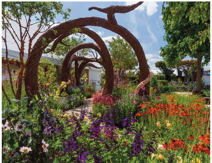
Sensory gardens can be beneficial to people with dementia