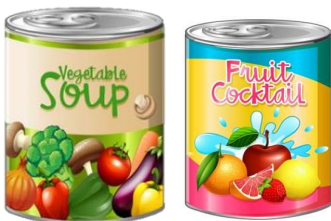
Steel food cans