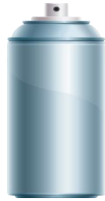
Empty spray can