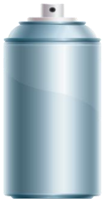
Empty spray can