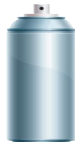
Empty spray cans