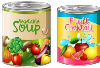
Steel food cans