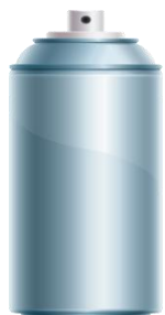
Empty spray can