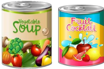
Steel food cans