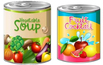
Steel food cans