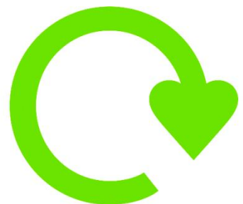
Recycle Swoosh logo