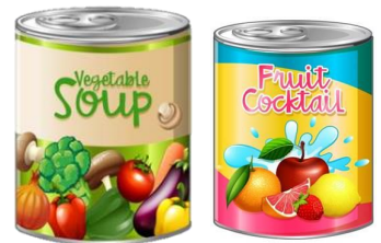
Steel food cans