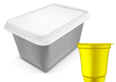
Plastic food tubs