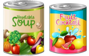
Steel food cans