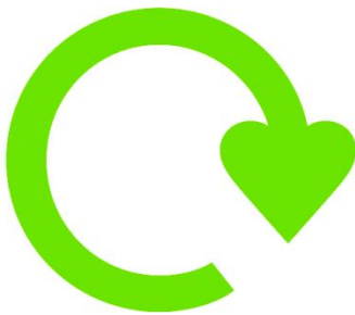
Recycle Swoosh logo