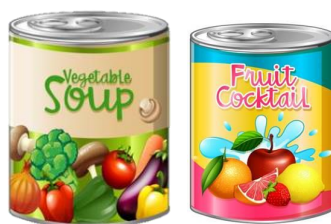
Steel food cans