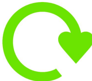
Recycle Swoosh logo