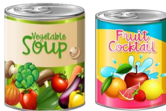
Steel food cans