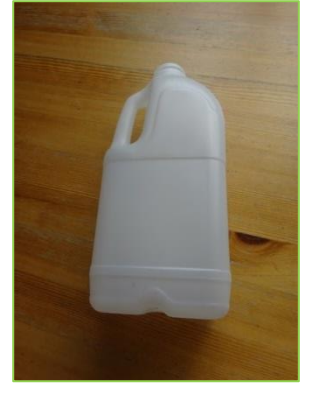
1 . Wash out well an empty plastic milk bottle.