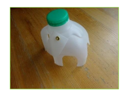
7 . Add the lid for hat, googly eyes, stickers, scraps of fabric, feathers, sequins, tissue paper, glitter, etc and enjoy decorating your elephant!