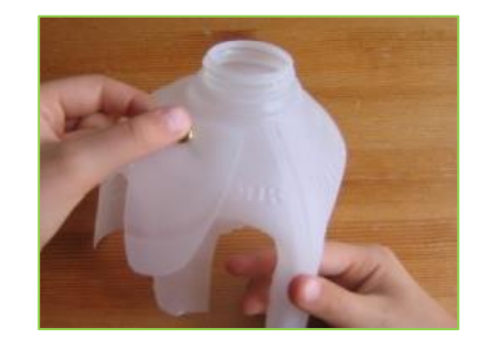
6. Now use the left-over cut-out pieces to make the ears. Push a split pin through the ear piece and then the main body. Open up split pin. Repeat on both sides.