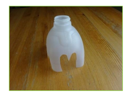
5. At the rear cut out a 'M' shape to create a tail.