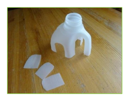
4. Cut out an arch shape under the handle to create the trunk.