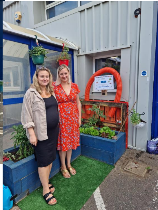
Portfolio Holder (left) and Cabinet member with responsibility for Sustainability, Climate Action and Transport (right) for Milton Keynes Council along with a photo with the team (far left)