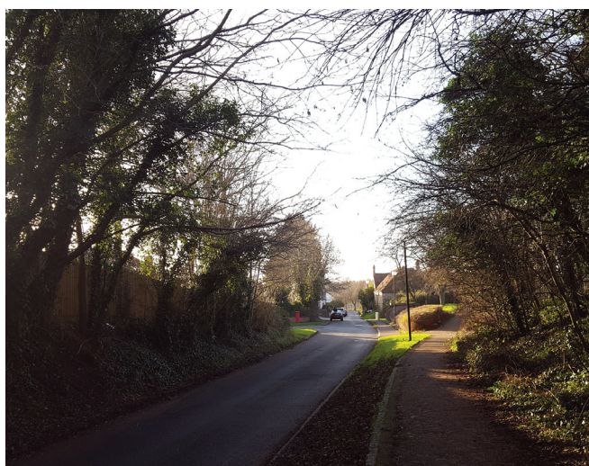
View down Primrose Road to Home Farm Barns

Amec Foster Wheeler, Draft Management Plan for Bradwell Conservation Area, Unpublished.