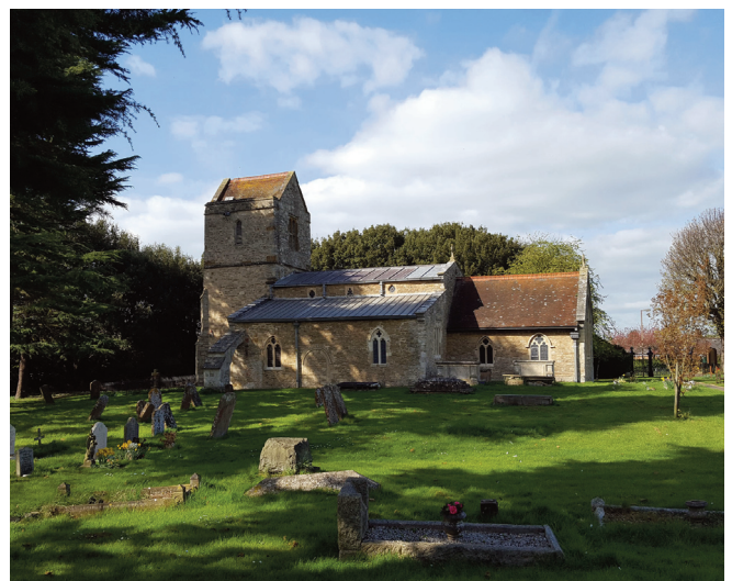
St Lawrence Church

Where historic materials and details survive they usually impart a strong sense of character and individuality to the buildings and areas in which they are located.