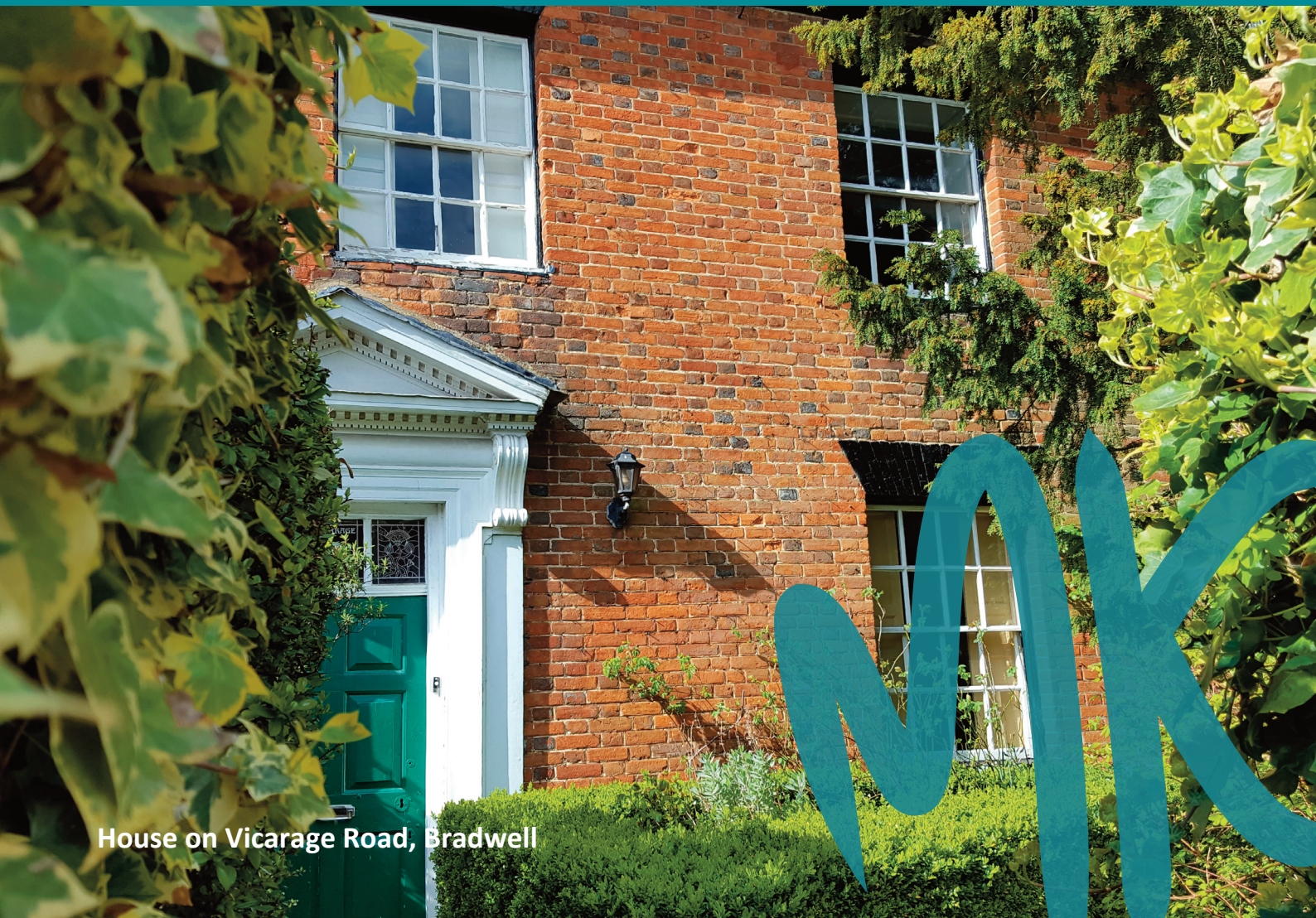
House on Vicarage Road, Bradwell

This document is to be read in conjunction with the General Information Document available on line