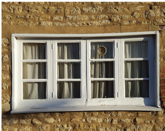
Traditional cottage window