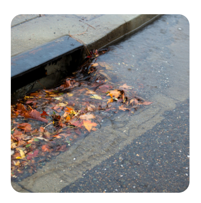
Dead leaves blocking a drain