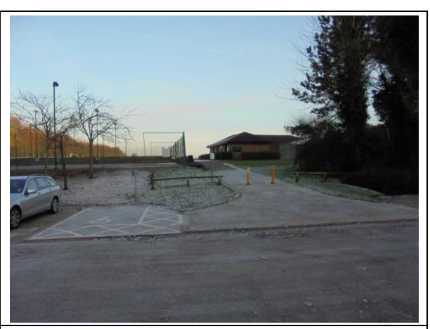
Grand Union canal