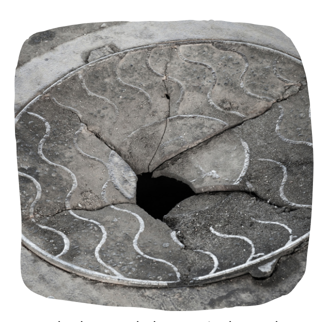
A broken manhole cover in the road.

If the damaged asset is a safety issue, MKCC will make it safe by either putting a cordon around it or by using a cone to alert anyone to avoid the area. The asset owner must carry out maintenance to their apparatus or equipment under Section 81 of NRSWA.