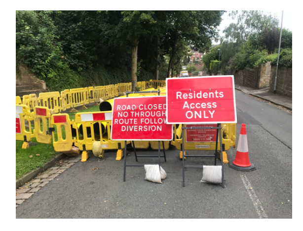
Streetworks taking place to install utilities pipes in the verge.

The <u>Highways Act 1980</u> is the UK legislation that covers roadworks.