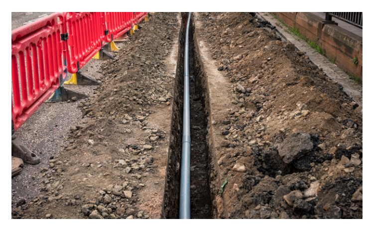
A fibre broadband cable duct being laid in the ground under a footway.