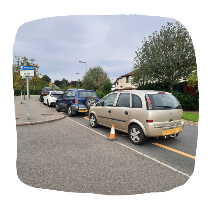
Cars parked on the yellow 'School Keep Clear' zig zag markings outside a primary school in Greenleys.

If you would like to find out more about travel plans for schools, email our Transport team, <u>Transport.Policy@milton-keynes.gov.uk</u>