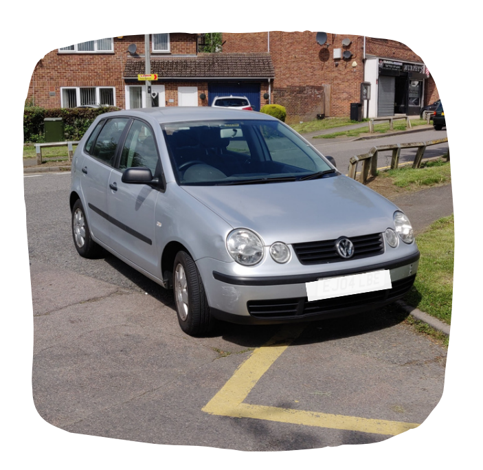
This driver has not only parking on the 'School Keep Clear' zig zags, but they are also blocking visibility at a busy junction in a residential area.