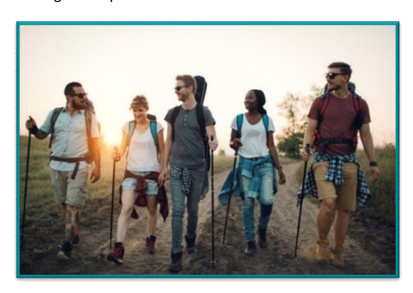
Figure 2. A social walk in the countryside is a great way to enjoy time with friends and get outdoors

We will identify and promote priority routes with consideration to areas of high density and well-used rights of way, as well as their proximity to populated areas. The priority of a route will then be able to help inform funding and improvement decisions.