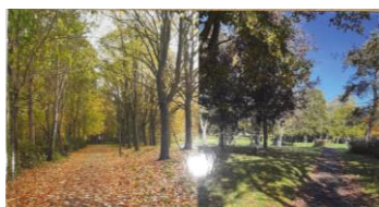
Fullers In Focus Photo Project By Residents 2023

During October there was a free digital photography course that ran for 4 weeks. This was a basic introduction on how to get the most out of your camera phone. All the attendees found this course really useful. If you would like to see the photos taken around the estate, there is a book in the Community Hub that you are welcome to view.