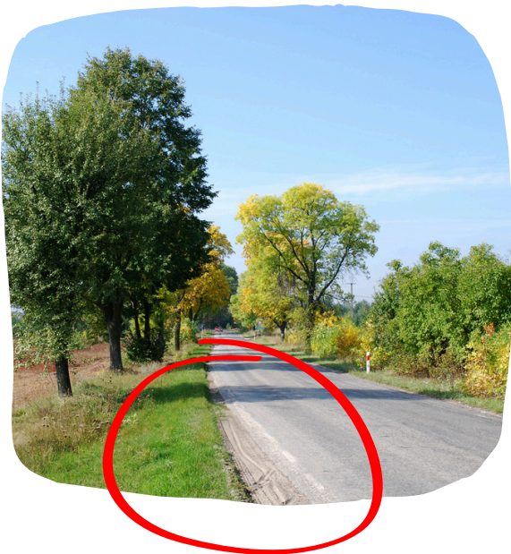
A rural road with no kerb at either side. The area between the road and the verge is called the 'haunch'.

This can happen often on certain sections of the road where vehicles, especially large or heavy vehicles, may need to pass by each other and there is limited room.