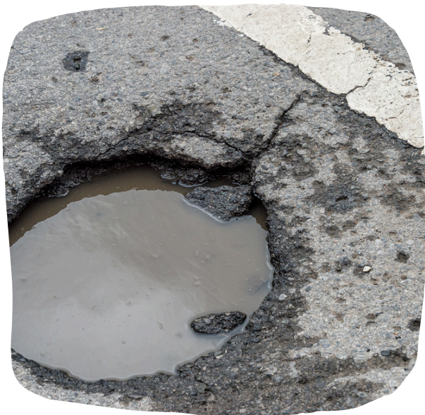
Example of a 'deep pothole'. It has a sharp-edged hole in the top road surface layer.

We can't fix every pothole reported to us but we do prioritise those that need to be done to keep the network safe.