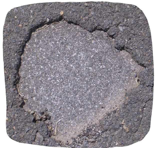
Example of a 'shallow pothole'. It is much lower in depth.