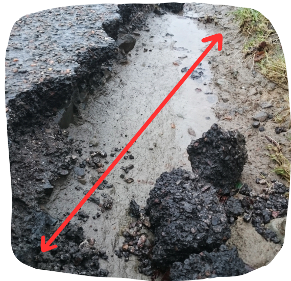
An example where the land has eroded at the edge and caused the road surface layers to break up.