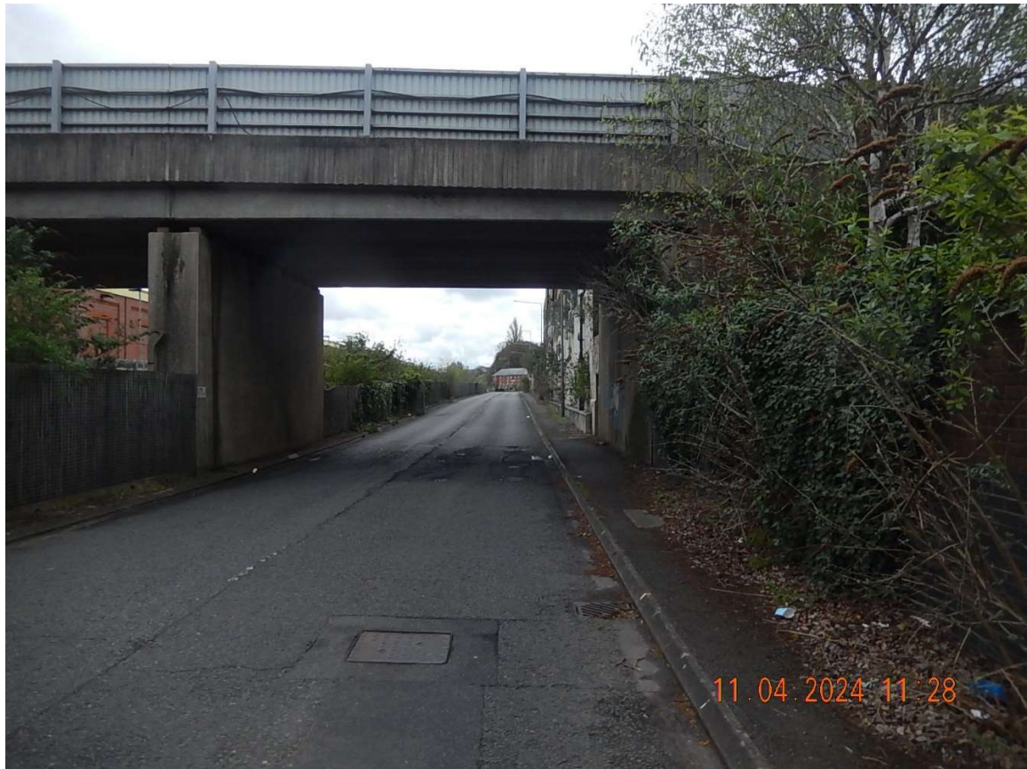
1. North elevation