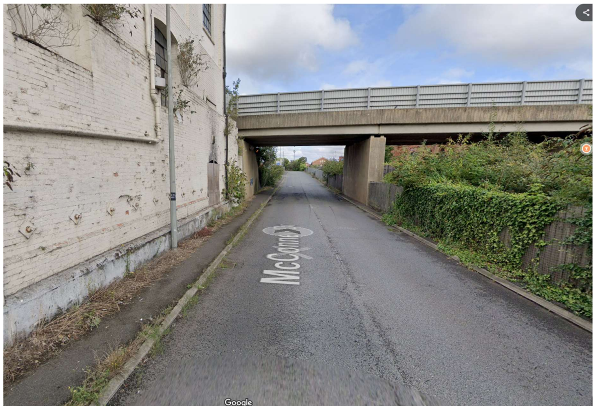
2. South elevation